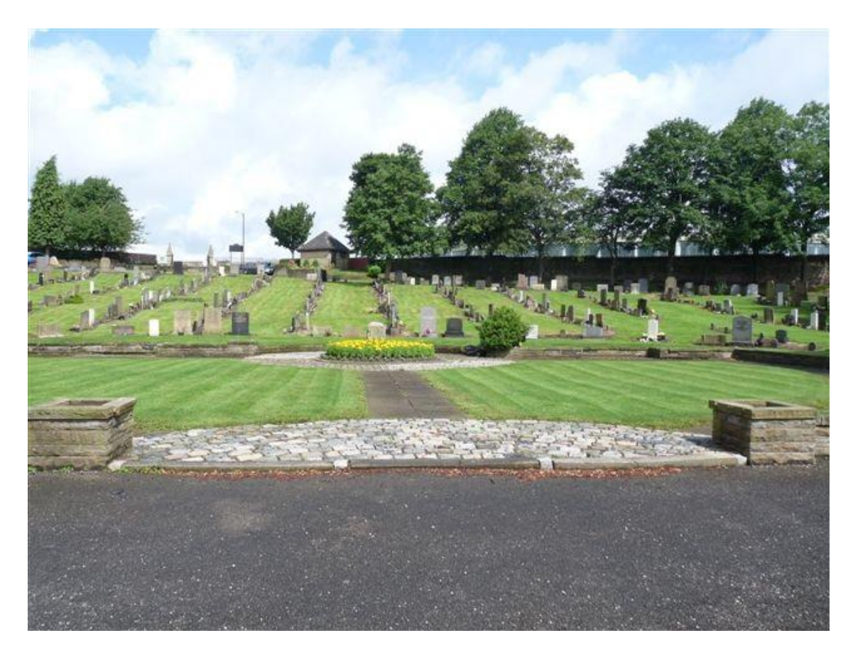
Philips Park Cemetery, Manchester, Lancashire