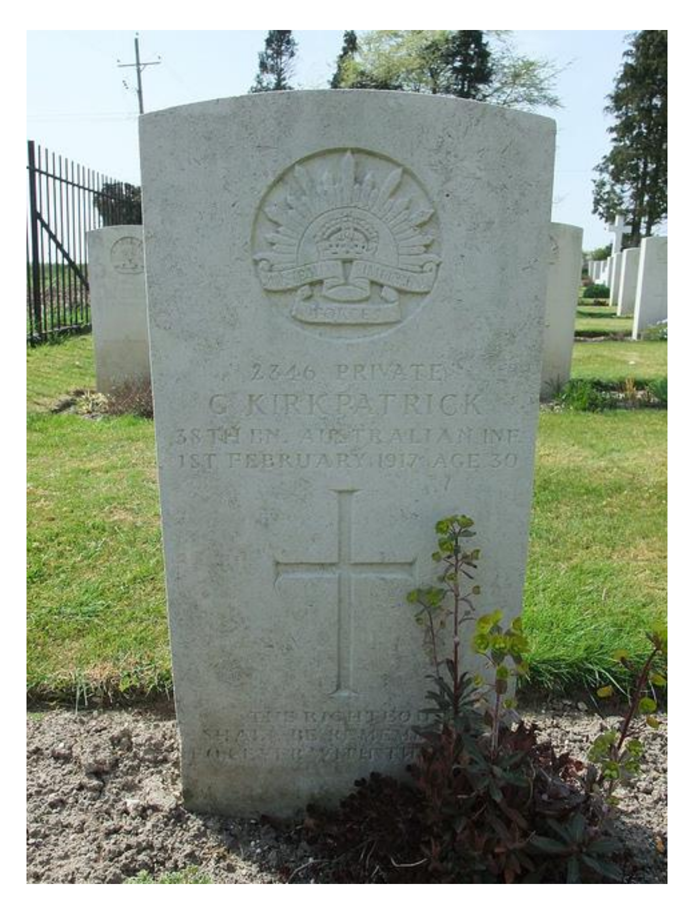
Photo of Pte G. Kirkpatrick's Headstone at Durrington Cemetery, Wiltshire.