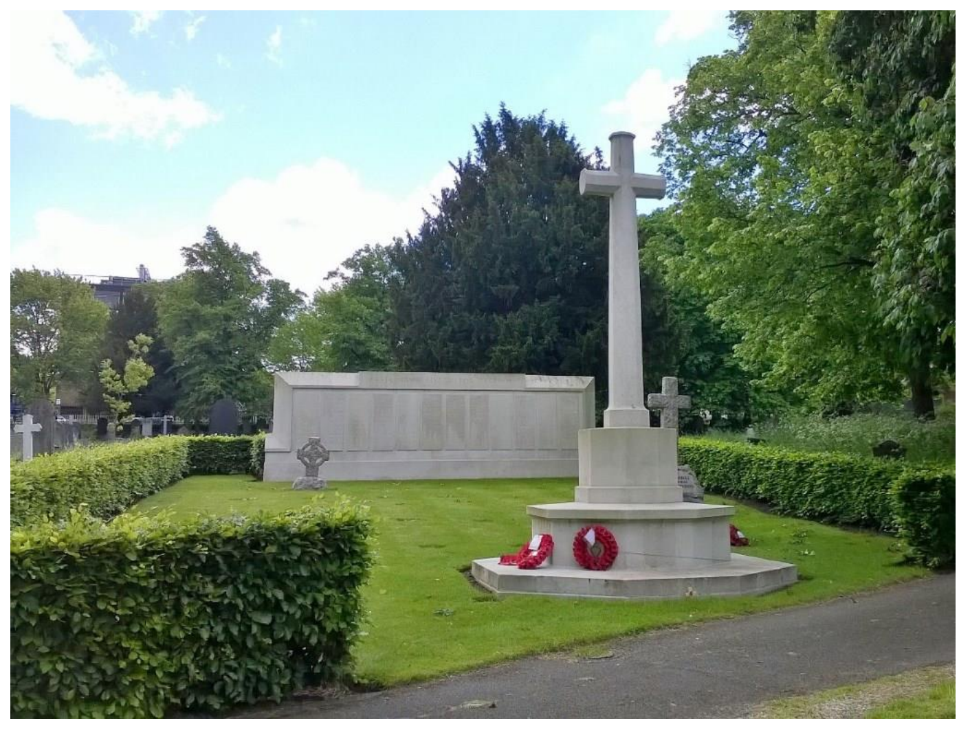
Cross of Sacrifice & Screen Wall in Welford Road Cemetery, Leicester