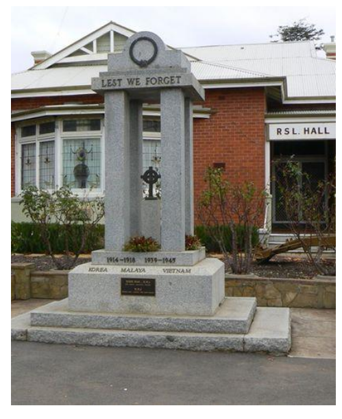
Castlemaine War Memorial

The Castlemaine War Memorial, located in front of RSL Hall, 36 Mostyn Street, Castlemaine, Victoria, does not have individual names.