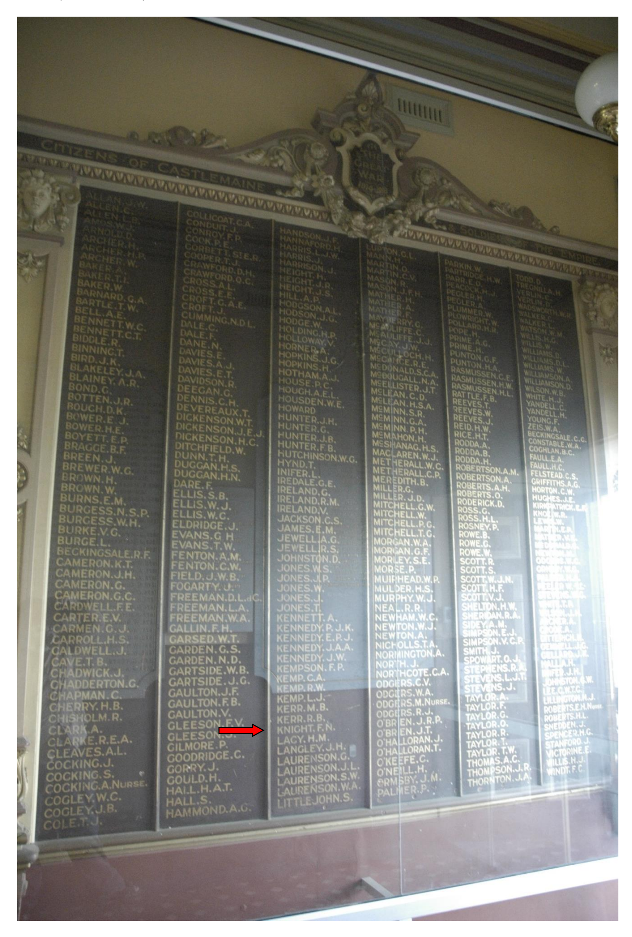
Castlemaine Town Hall Honour Roll

F. N. Knight is remembered on the Castlemaine Town Hall Honour Roll, located at Castlemaine Town Hall, 48 Lyttleton Street, Castlemaine, Victoria.