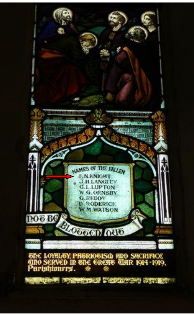
Christ Church War Memorial Stained Glass Window, Castlemaine