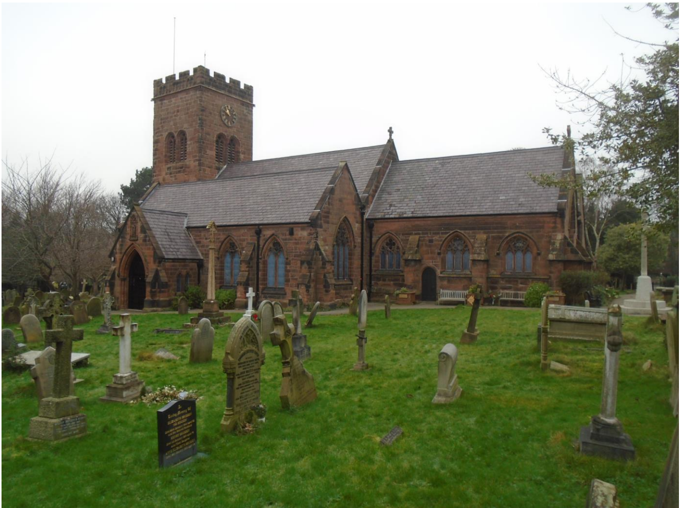
St. Bridget's Church, West Kirby

St. Bridget's Churchyard, West Kirby contains 11 Commonwealth War Graves – 9 relating to World War 1 & 2 from World War 2.