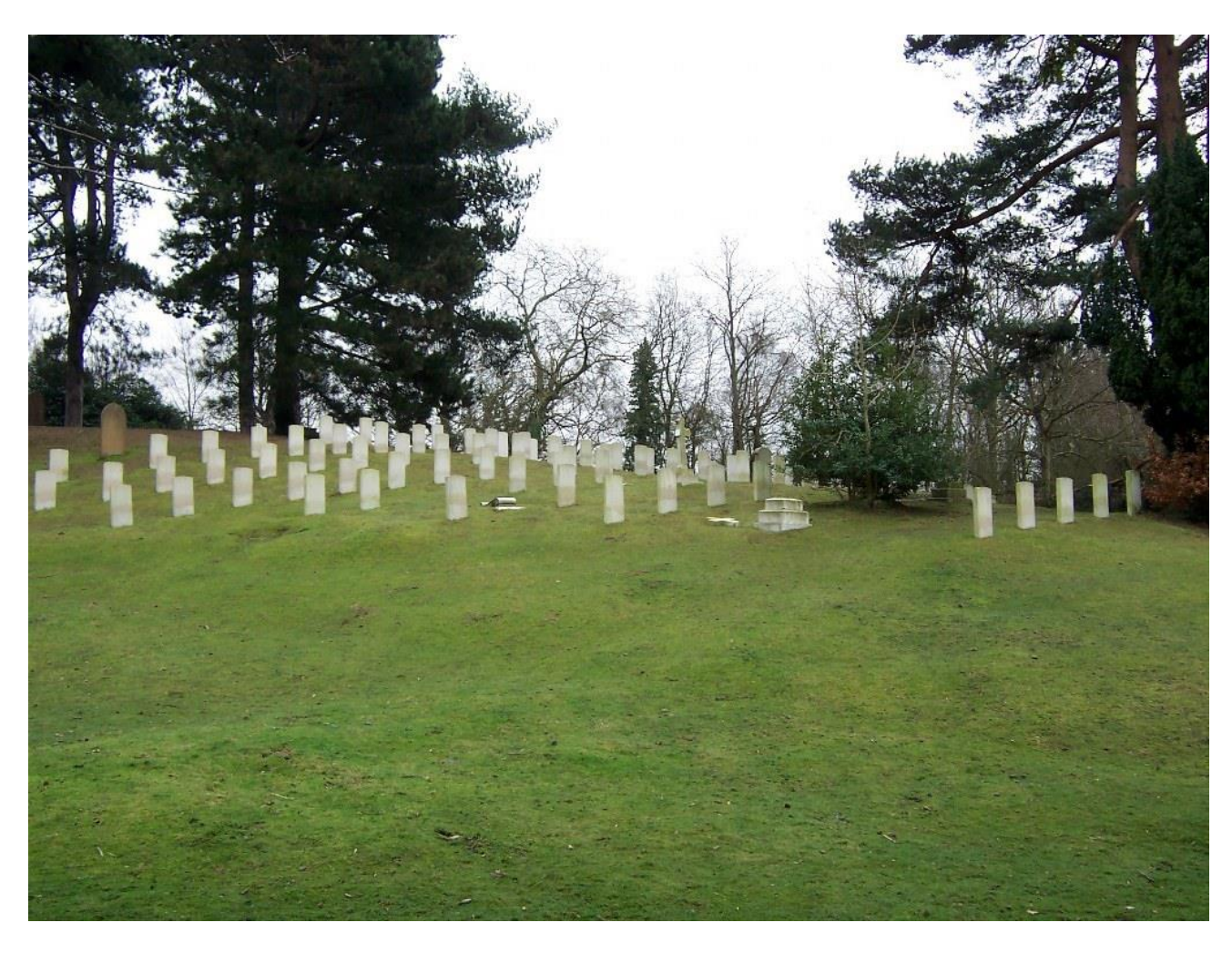
Netley Military Cemetery, Hampshire