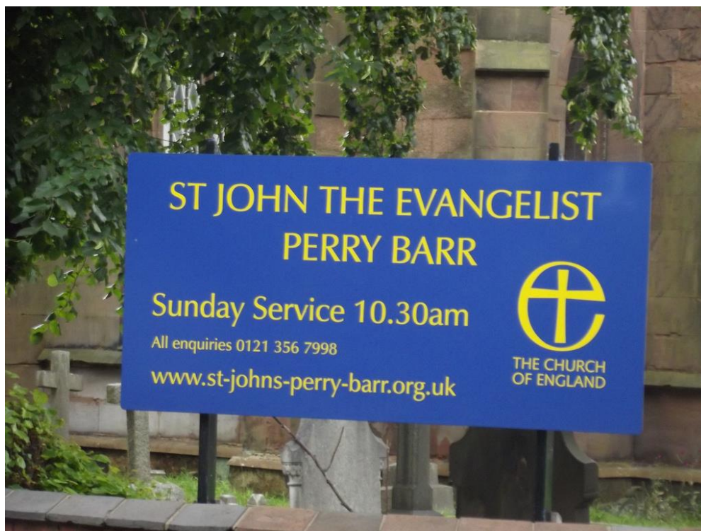
St. John the Evangelist Church, Perry Barr

St. John the Evangelist Church, Perry Barr contains 15 Commonwealth War Graves – 14 relating to World War 1 & 1 from World War 2.