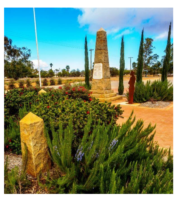
Carnamah War Memorial