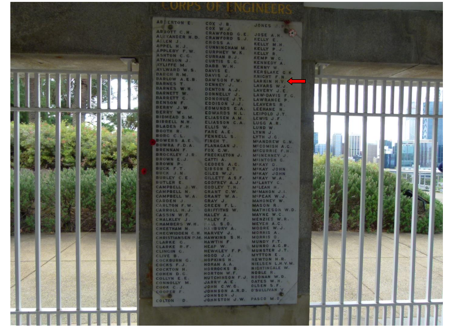
Corps of Engineers Panel

Sapper H. V. Larkin is commemorated on the Roll of Honour, located in the Hall of Memory Commemorative Area at the Australian War Memorial, Canberra, Australia on Panel 27.