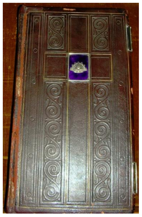
Roll of Honour Book of Tunnellers, St. Paul's Cathedral, London