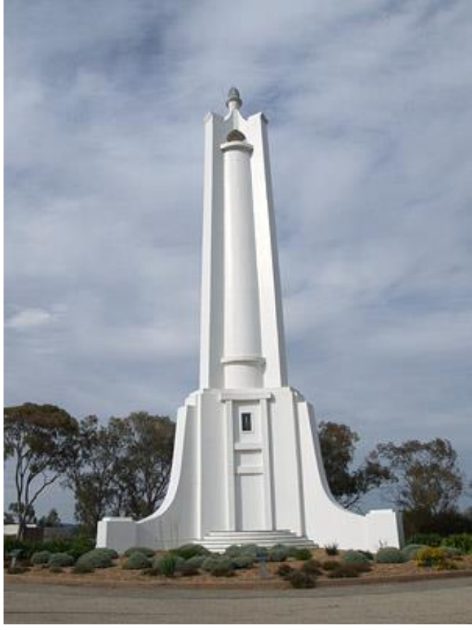
Albury War Memorial