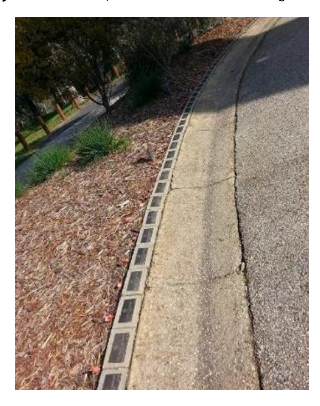
Individual Named Memorial Plaques