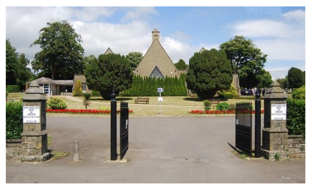
Entrance to Hastings Cemetery