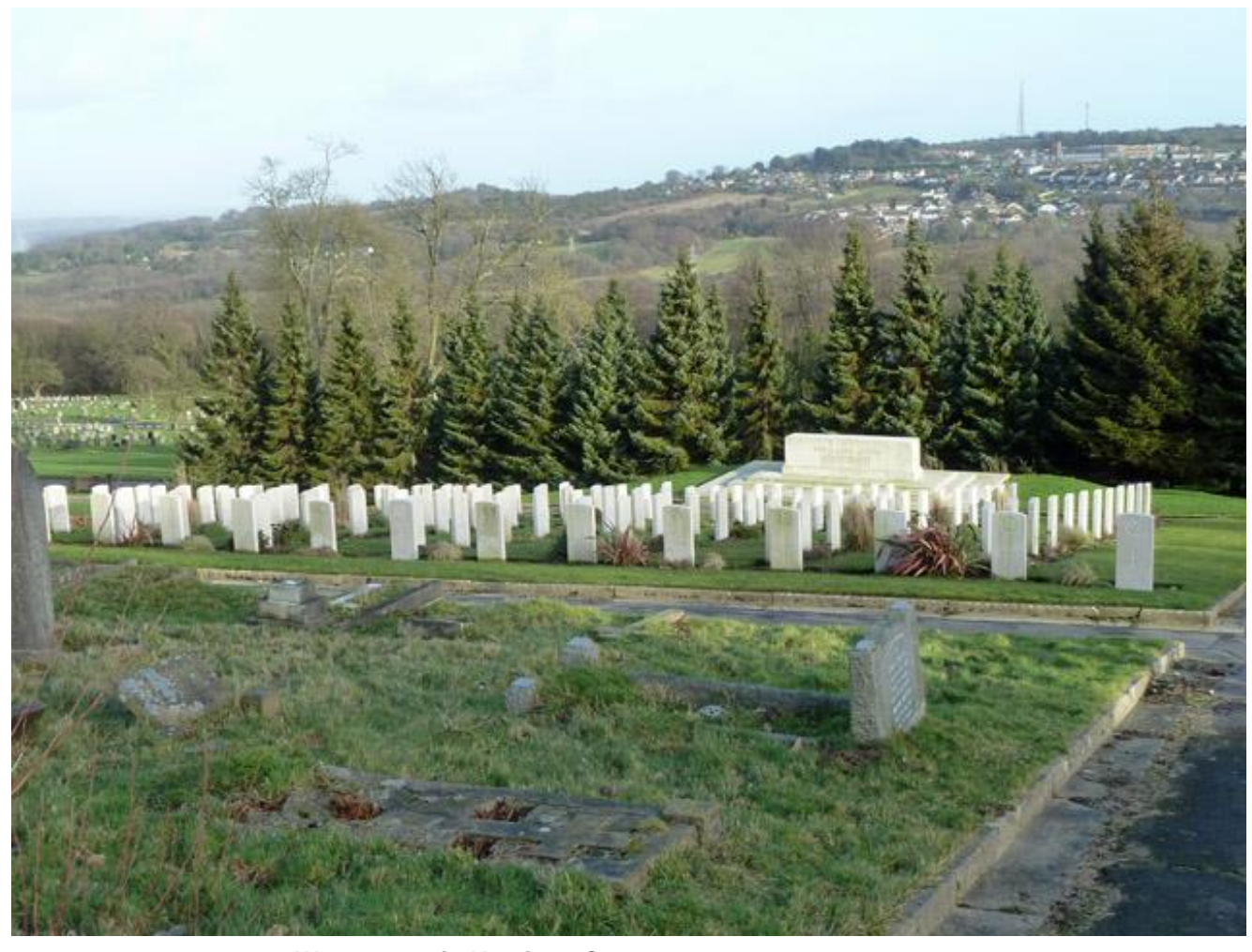
War Graves in Hastings Cemetery