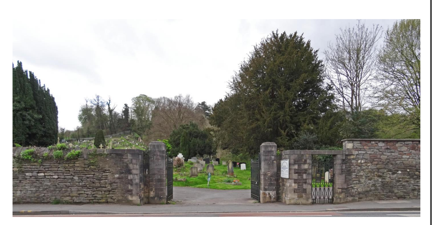
Holy Souls Roman Catholic Cemetery