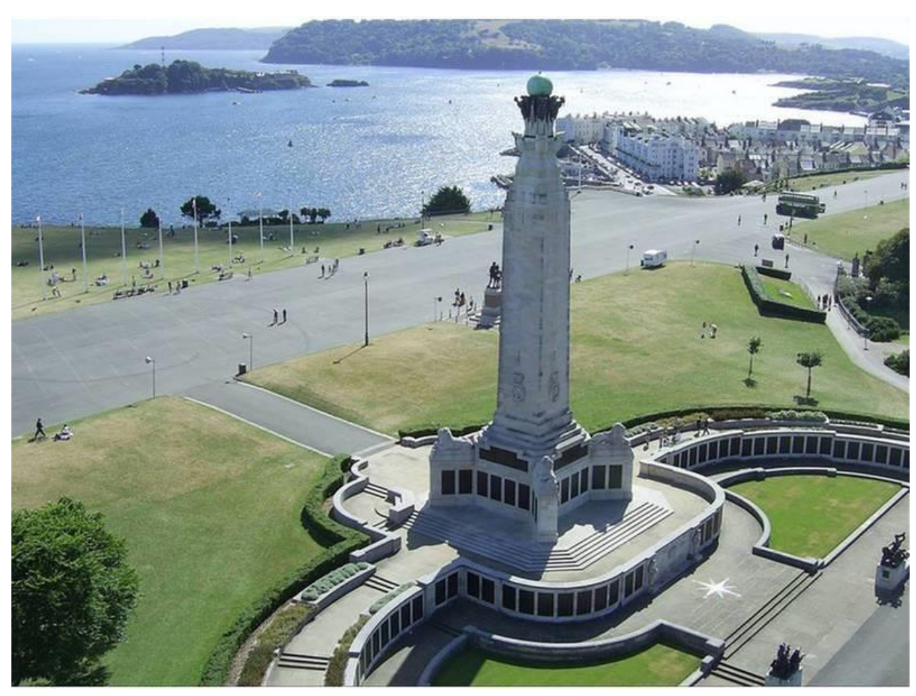
Plymouth Naval Memorial

Plymouth Naval Memorial commemorates 7,251 sailors of the First World War and 15,933 of the Second World War. (Information from CWGC)