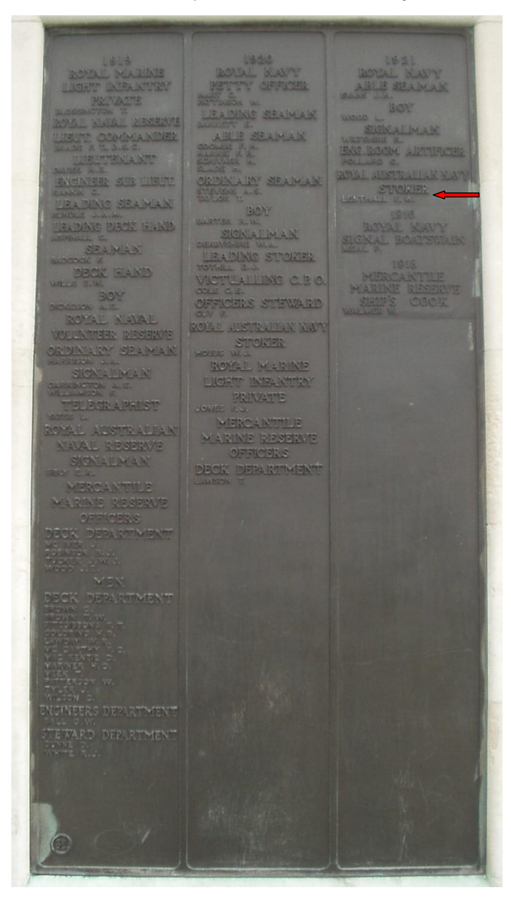
(Panel 32 - before cleaning)