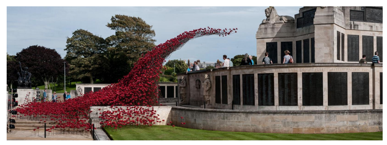
Poppies Wave at CWGC Plymouth Naval Memorial