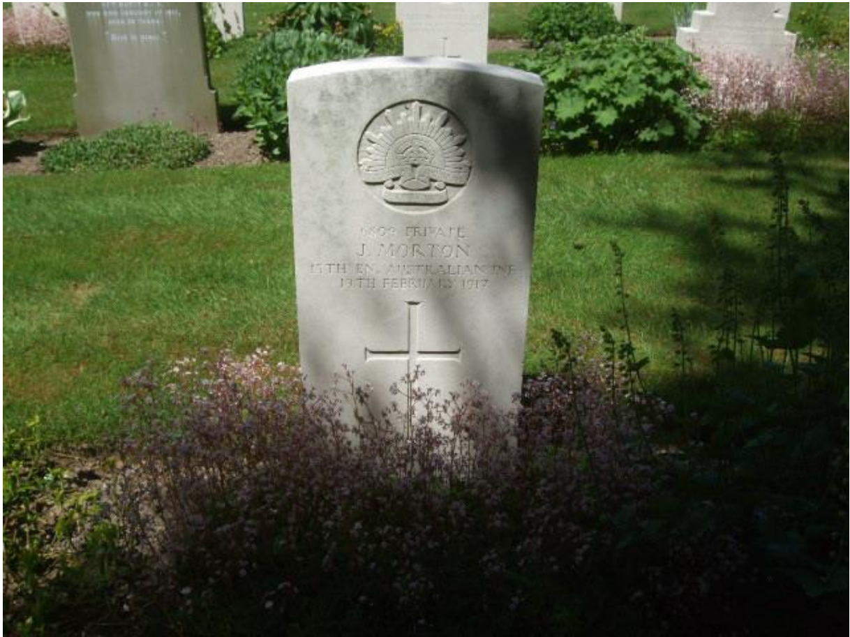
Commonwealth War Graves Headstone for Pte J. Morton is located in Main Front Row (Right hand side) Grave Plot # 8 of Codford War Graves Cemetery (CWGC Reference - Grave # 86)