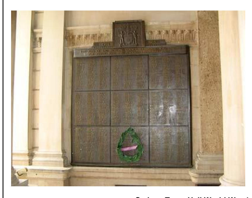
Sydney Town Hall World War 1 Honour Roll