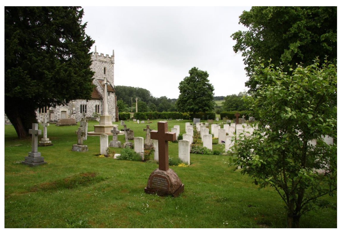
Churchyard of St. Lawrence, Stratford-sub-Castle with CWGC Cross of Sacrifice