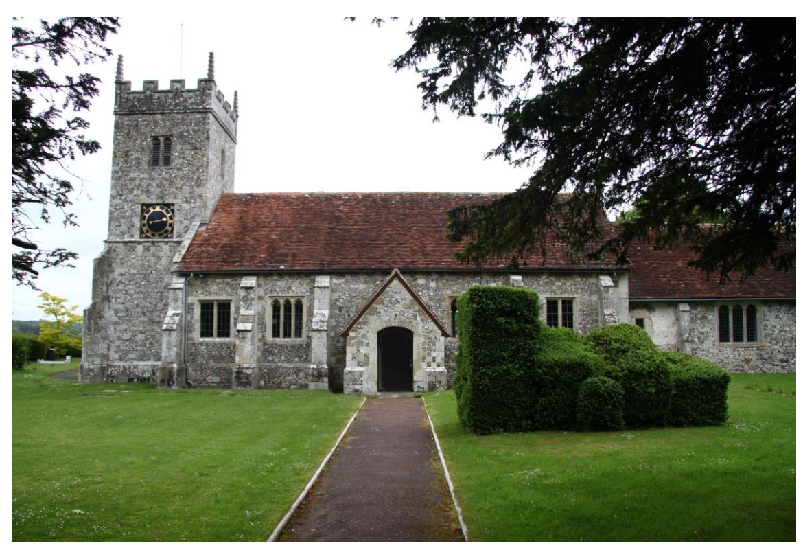
St. Lawrence Church, Stratford-sub-Castle

During the two world wars, the United Kingdom became an island fortress used for training troops and launching land, sea and air operations around the globe. There are more than 170,000 Commonwealth war graves in the United Kingdom, many being those of servicemen and women killed on active service, or who later succumbed to wounds. Others died in training accidents, or because of sickness or disease. The graves, many of them privately owned and marked by private memorials, will be found in more than 12,000 cemeteries and churchyards. Most of the 47 First World War burials in Stratford-sub-Castle (St Lawrence) Churchyard were made from the local hospital and more than half of them are of Australian servicemen who were based at the many Australian depots and training camps in the area. There are also two burials of the Second World War in the cemetery. ( Information from CWGC )