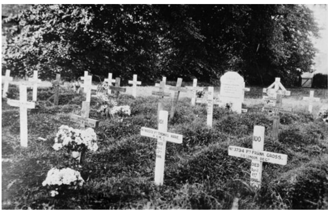
Original Grave Markers