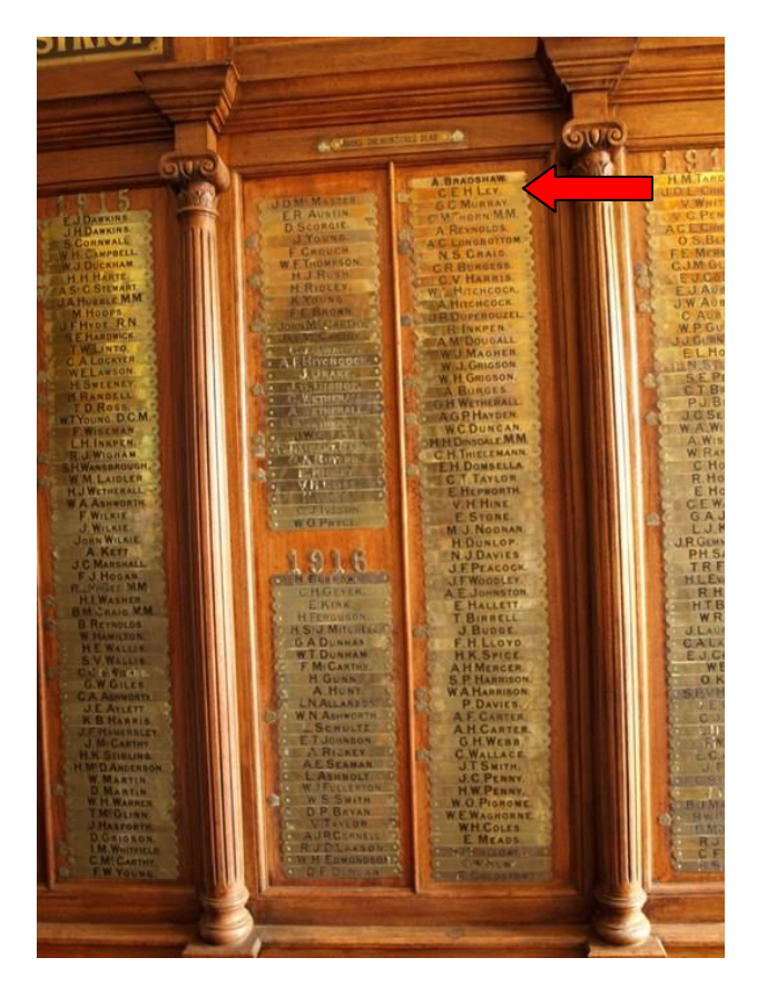
York War Memorial Honour Board