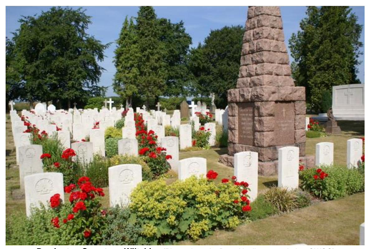
Durrington Cemetery, Wiltshire