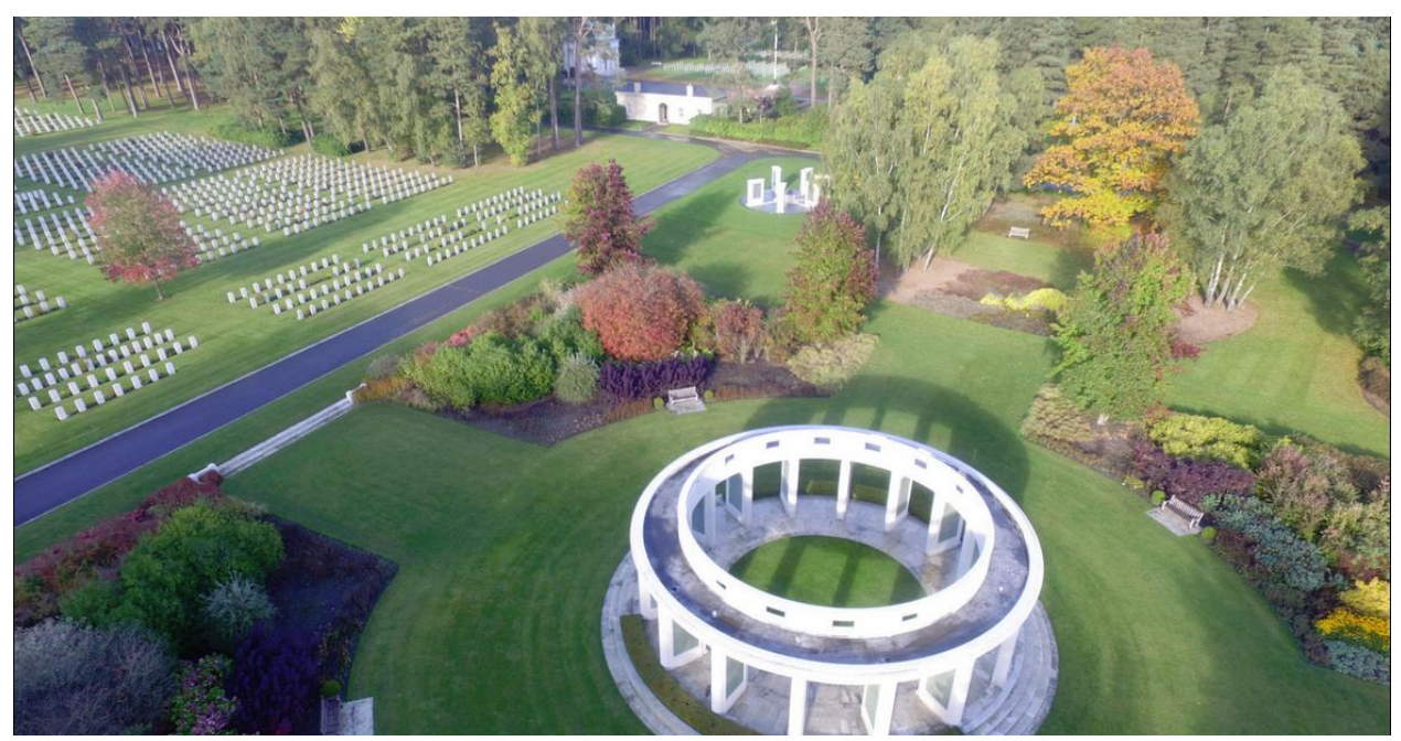
Brookwood Military Cemetery

There are 446 Australian War Graves in Brookwood Military Cemetery – 351 from World War 1 & 95 from World War 2.