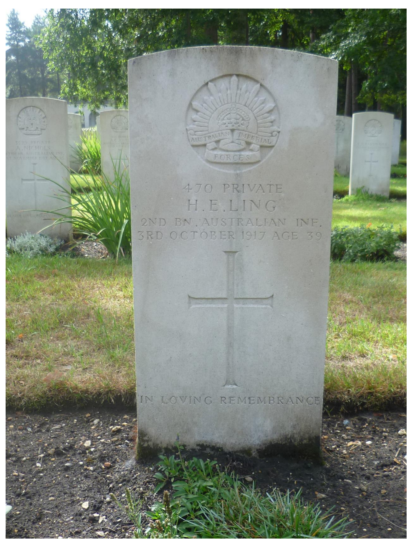
Photo of Private H. E. Ling's Commonwealth War Graves Commission Headstone in Brookwood Military Cemetery, Surrey, England.