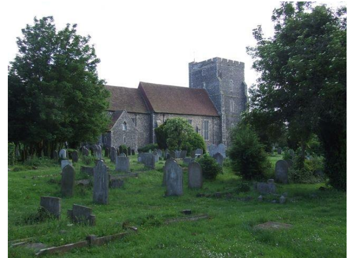
Holy Trinity Churchyard, Milton Regis

Holy Trinity Churchyard, Milton Regis, Kent contains 9 Commonwealth War Graves – 7 relate to World War 1 & 2 from World War 2.