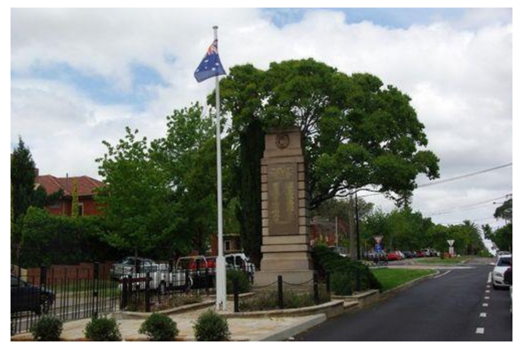
Punchbowl Cenotaph