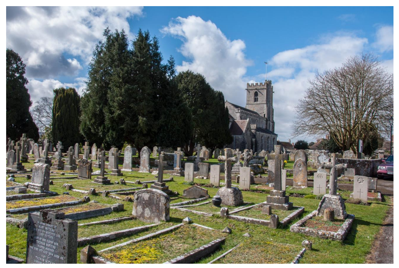
Wareham Cemetery, Wareham

Wareham Cemetery, Wareham, Dorset contains 71 Commonwealth War Graves. Wareham Military Hospital, with 185 beds, was at Worgret Camp during the First World War and the regimental depot of the Royal Armoured Corps was at nearby Bovington during the Second World War. Wareham Cemetery contains 49 First World War burials and 15 from the Second World War, 5 being unidentified. The cemetery also contains 12 German burials, 1 being an unidentified airman. (Information from CWGC)