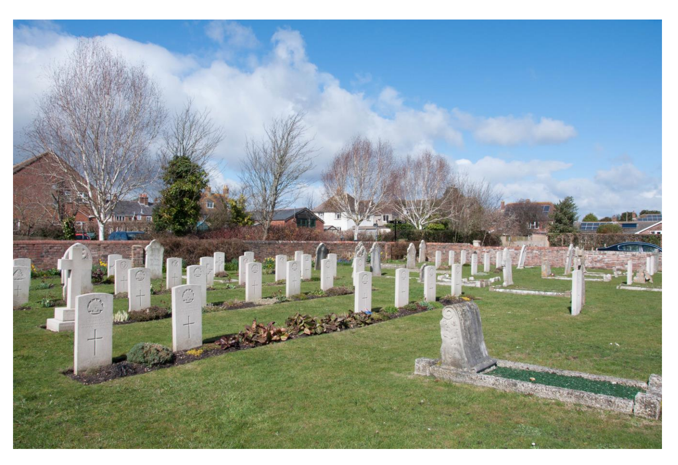
Wareham Cemetery, Wareham