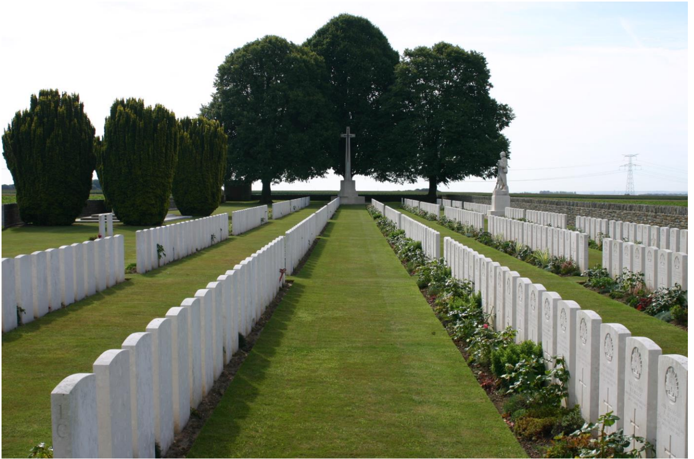
Vignacourt British Cemetery, France