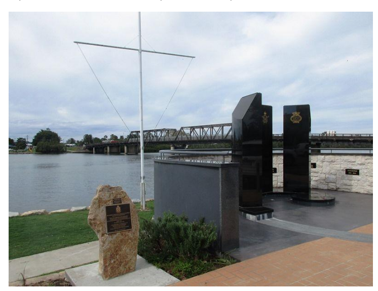
Macksville War Memorial

The Macksville War Memorial, located at River Street, Macksville, NSW does not list individual names.