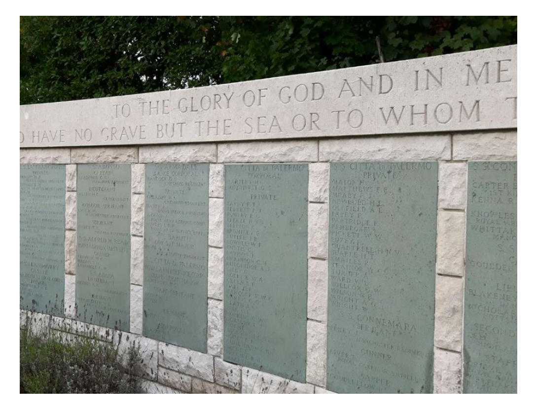
Name Panels behind Cross of Sacrifice