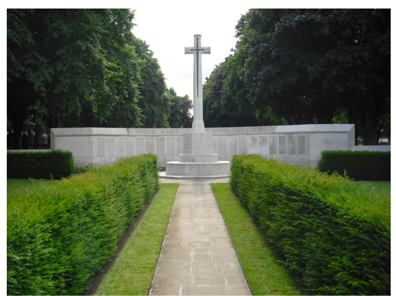
Tottenham Cemetery