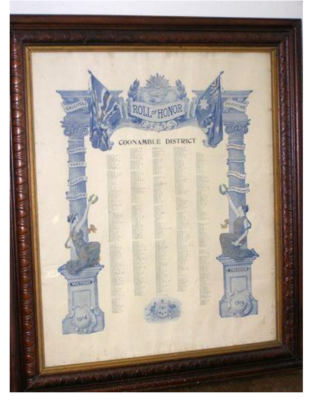
Coonamble District Honour Roll

The Coonamble District Honour Roll, which is a framed paper roll, commemorates those from the district who served in World War One & is located in Coonamble RSL, 18 Castlereagh Street, Coonamble, NSW.