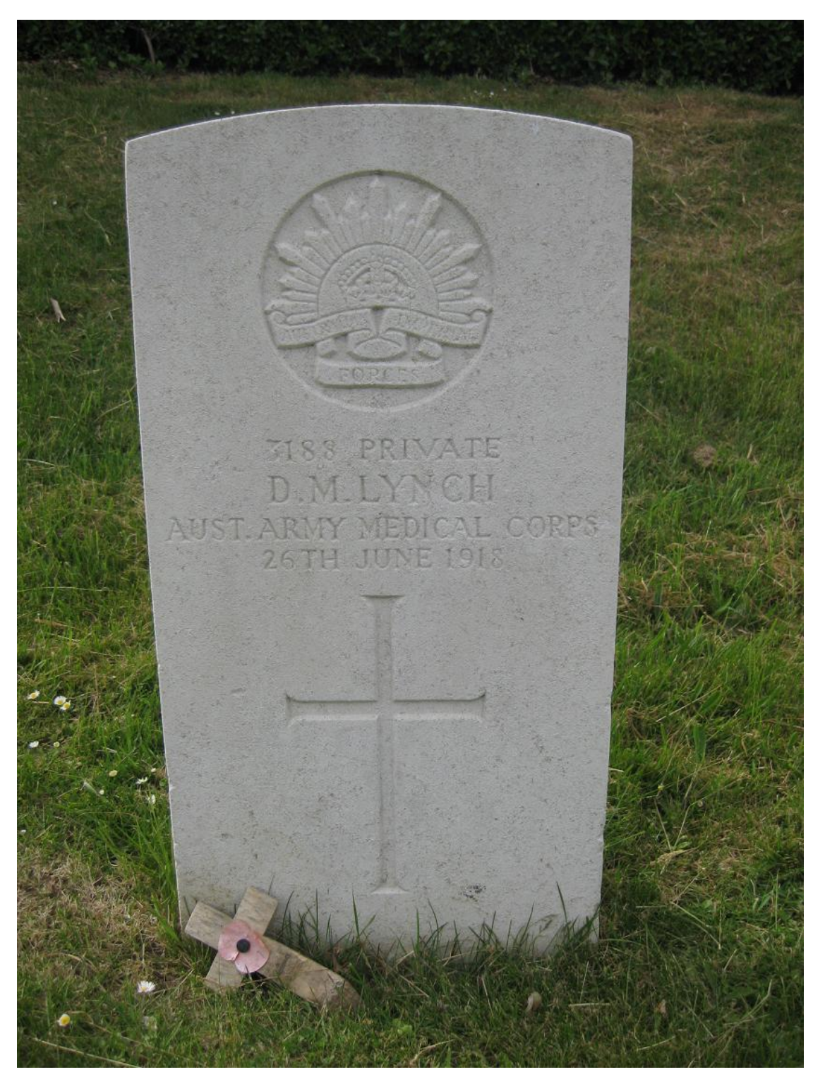
Photo of Pte D. M. Lynch's Commonwealth War Graves Commission Headstone in Hove Old Cemetery, Hove, Sussex, England.