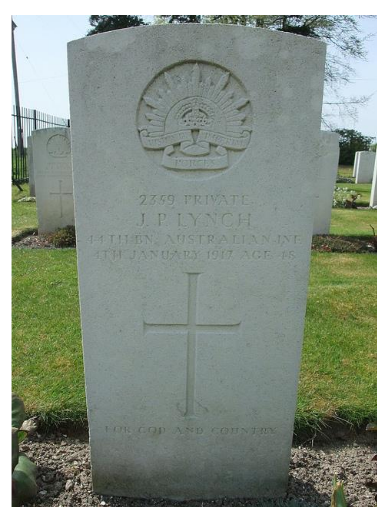
Photo of Private J. P. Lynch's Commonwealth War Graves Commission Headstone at Durrington Cemetery, Wiltshire, England.