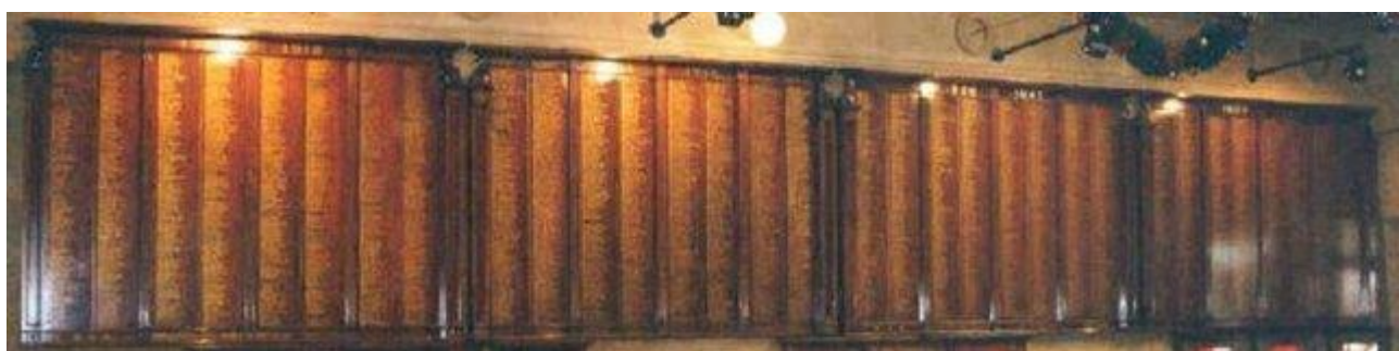
South Australian Railways Honour Board

T. F. Lynch is remembered on the South Australian Railways Honour Board, located at Adelaide Railway Station concourse (North End) Adelaide, South Australia.