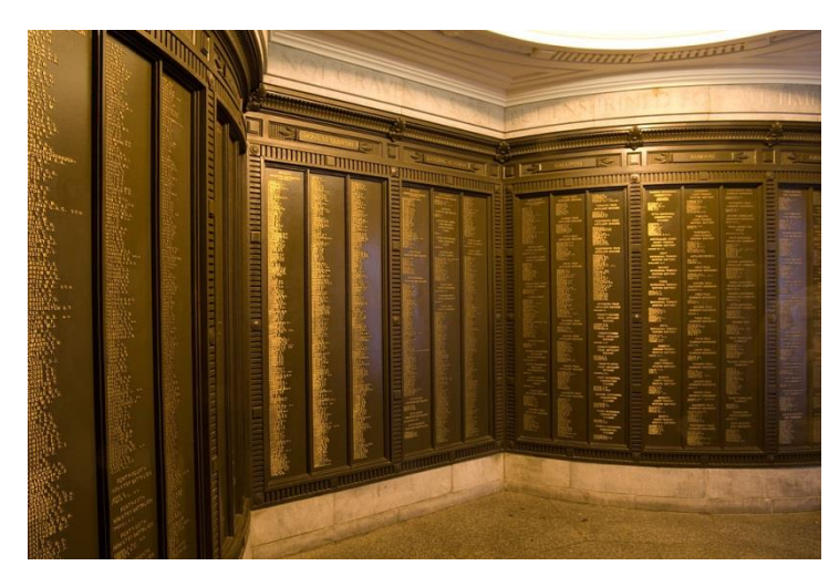
National War Memorial - Adelaide

T. F. Lynch is remembered on the South Australian Railways Honour Board, located at Adelaide Railway Station concourse (North End) Adelaide, South Australia.