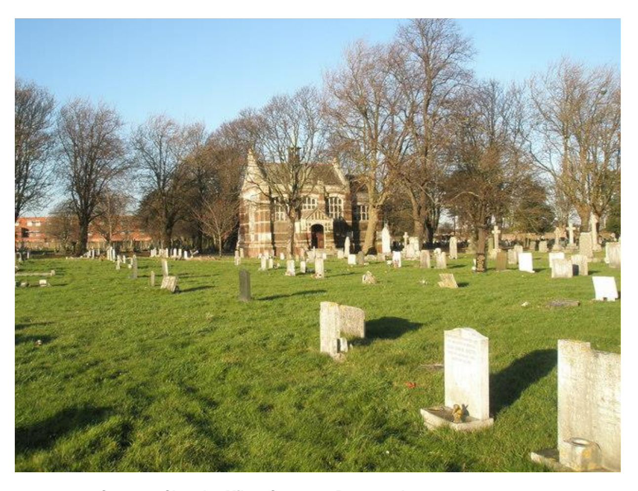
Cemetery Chapel at Milton Cemetery, Portsmouth