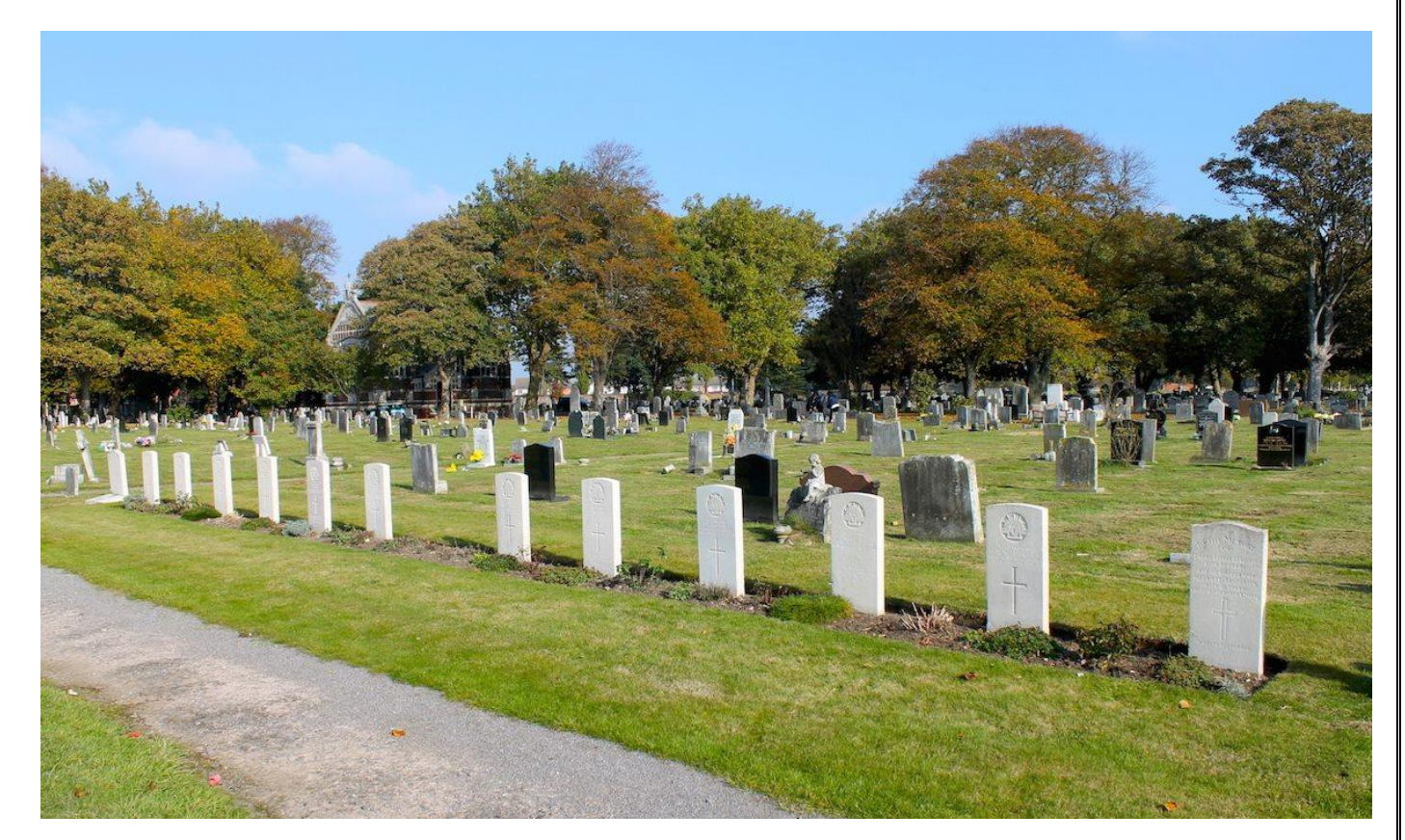
Australian War Graves in Milton Cemetery, Portsmouth