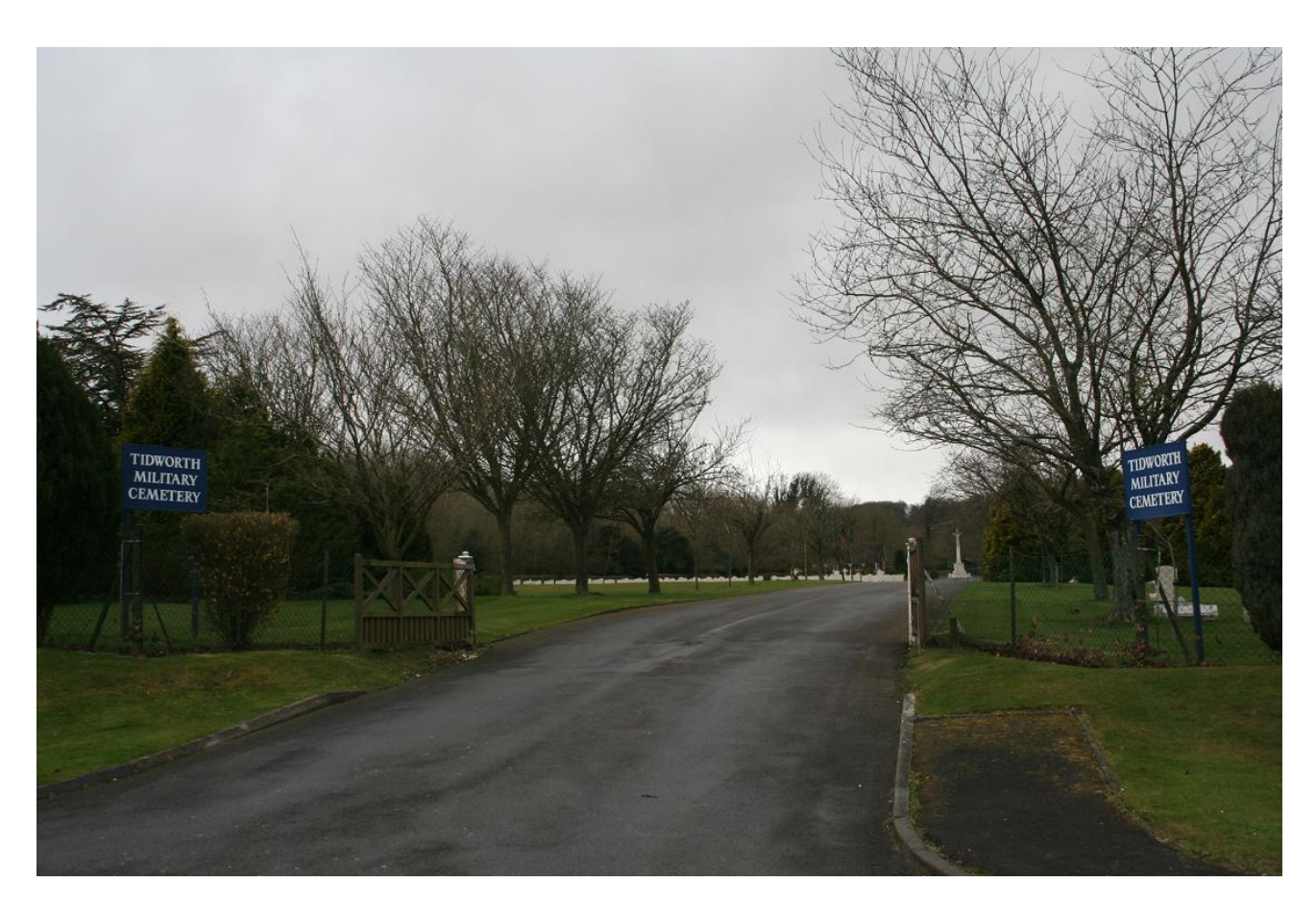
Tidworth Military Cemetery