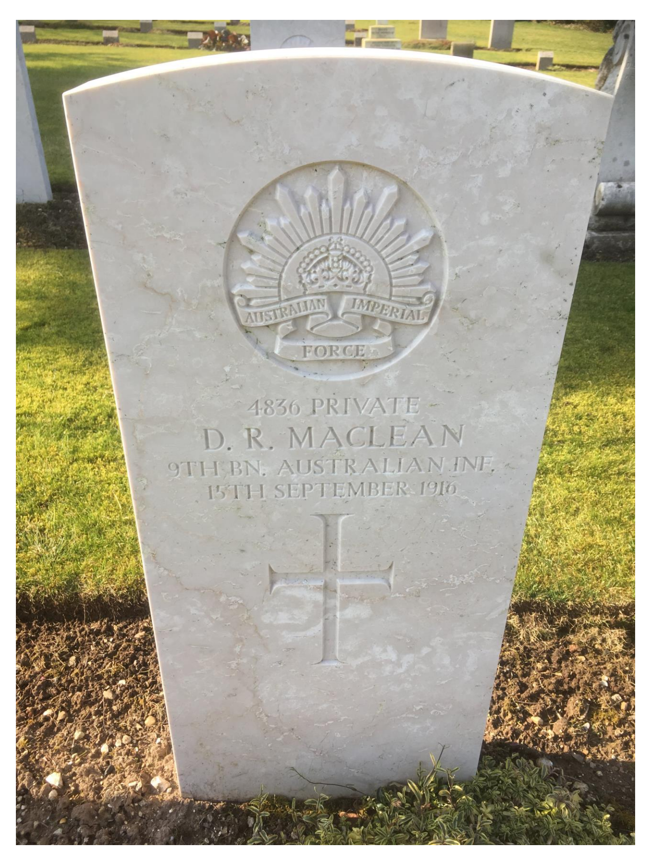
Photo of Private D. R. Maclean's Commonwealth War Graves Commission Headstone in Tidworth Military Cemetery, Wiltshire, England.