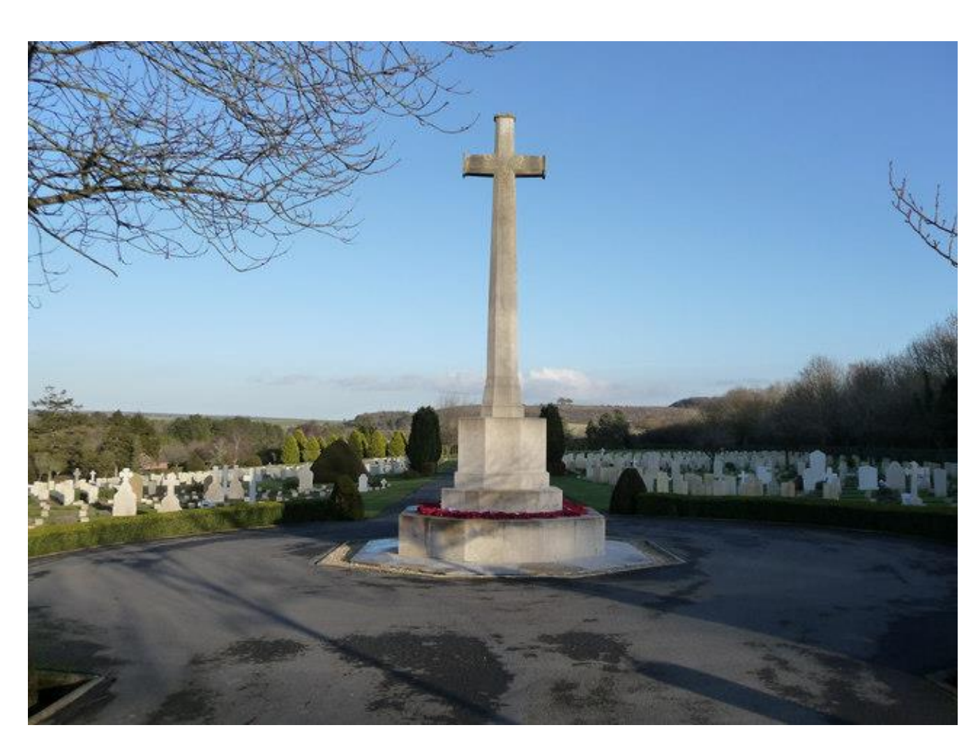
Tidworth Military Cemetery, Wiltshire