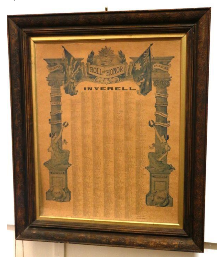
Inverell Roll of Honour

R. L. <u>McL</u>ean is remembered on the Inverell Roll of Honour, located at Inverell R.S.L. Museum, Inverell Pioneer Village, Tingha Road, Inverell, NSW.