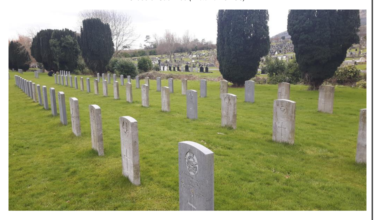
Belfast City Cemetery