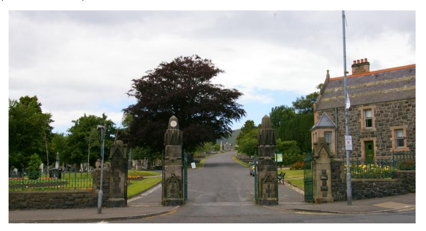
Belfast City Cemetery