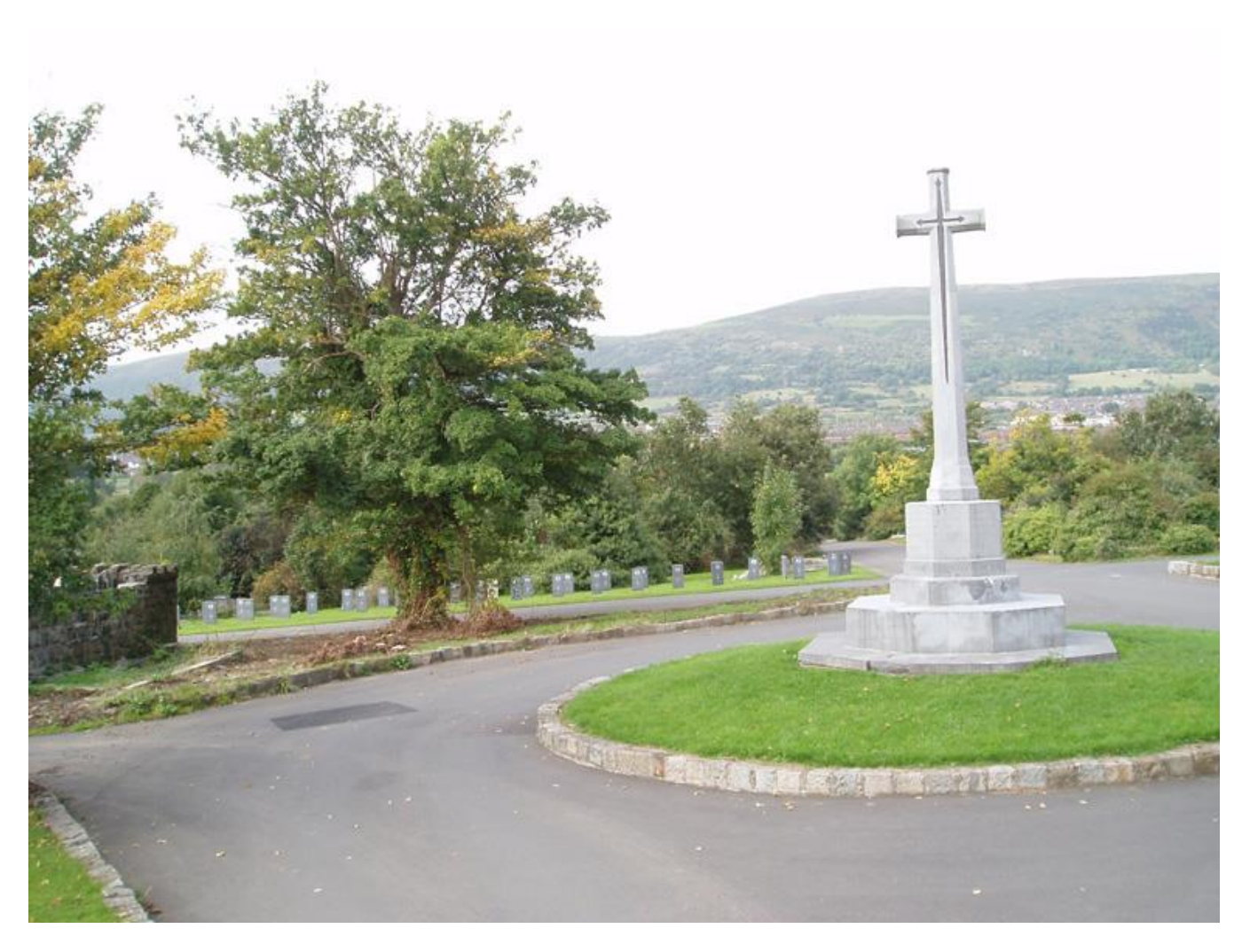
Cross of Sacrifice