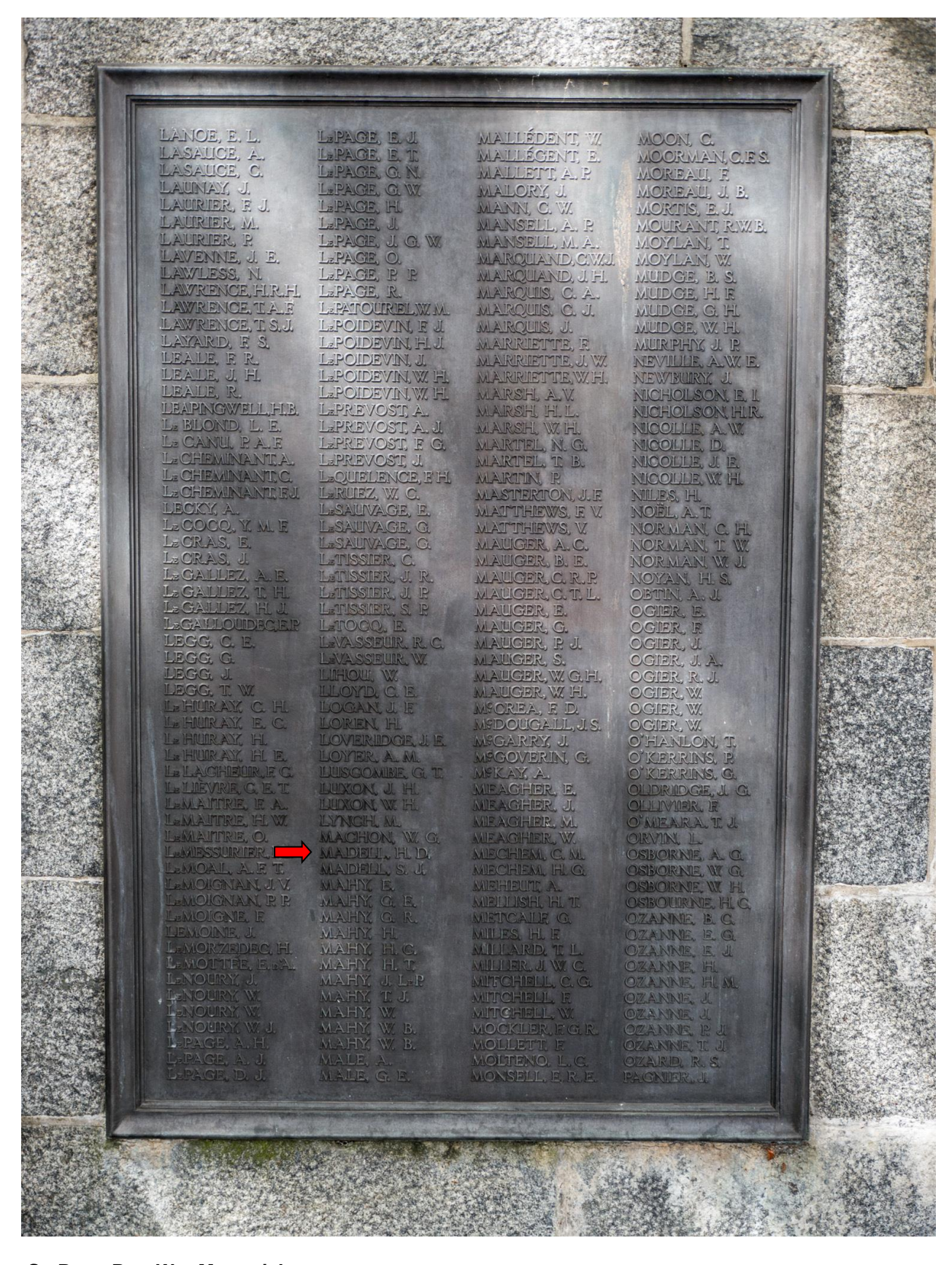
St. Peter Port War Memorial