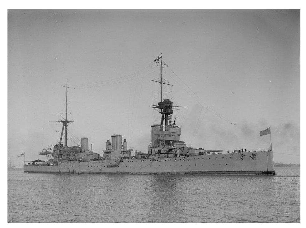
H.M.A.S. Australia 1914

In 1917 H.M.A.S. Australia was on routine of patrol and fleet exercises in the North Sea. In 1918 H.M.A.S. Australia was used for aircraft experiments & on 8th March, 1918 & again on 14th May a Sopwith 1½ Strutter was successfully launched from a platform erected on one of her 12-inch gun turrets. These were the first ever launchings of a two-seater aircraft from a battle cruiser. By the end of the war nearly every British capital ship carried a Strutter for reconnaissance and a Sopwith Pup or Sopwith Camel as a fighter.