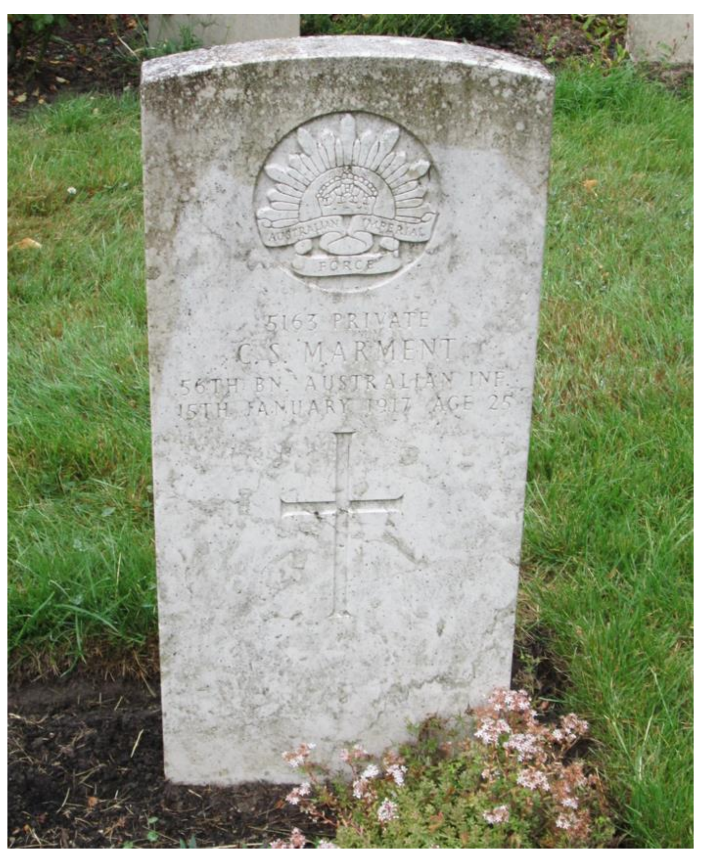
Photo of Private C. S. Marment's Commonwealth War Graves Commission Headstone in Wandsworth (Earlsfield) Cemetery, London, England.