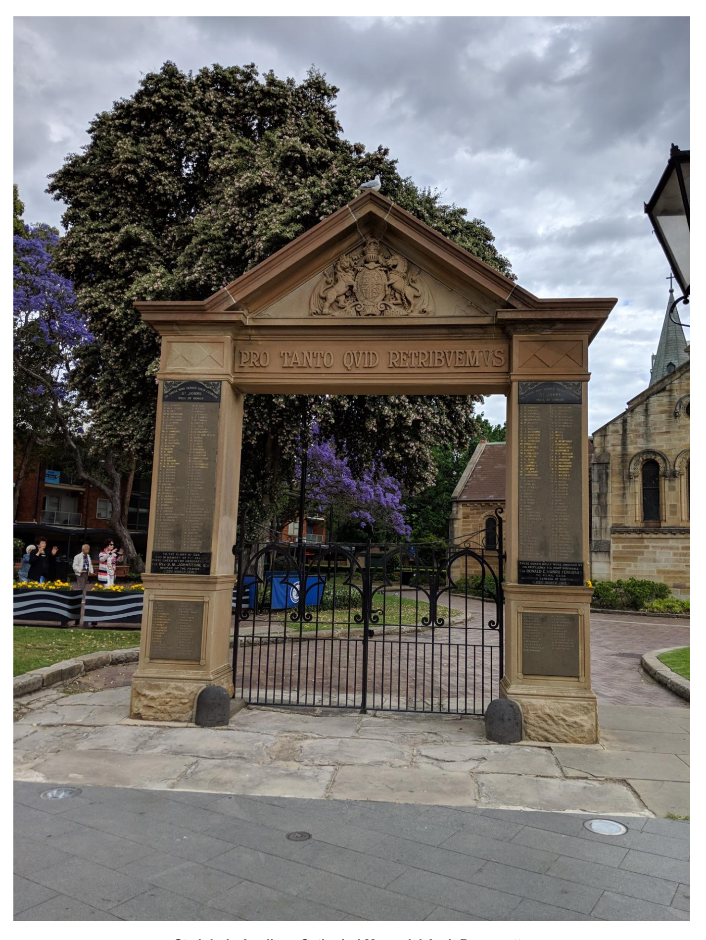
St. John's Anglican Cathedral Memorial Arch Parramatta