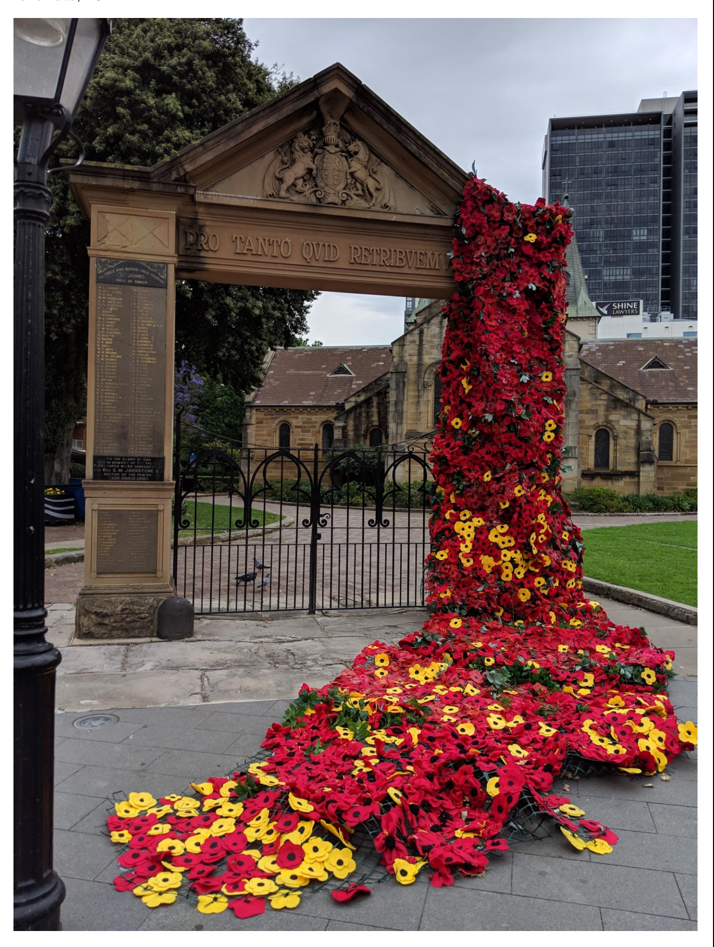
St. John's Anglican Cathedral Memorial Arch Parramatta