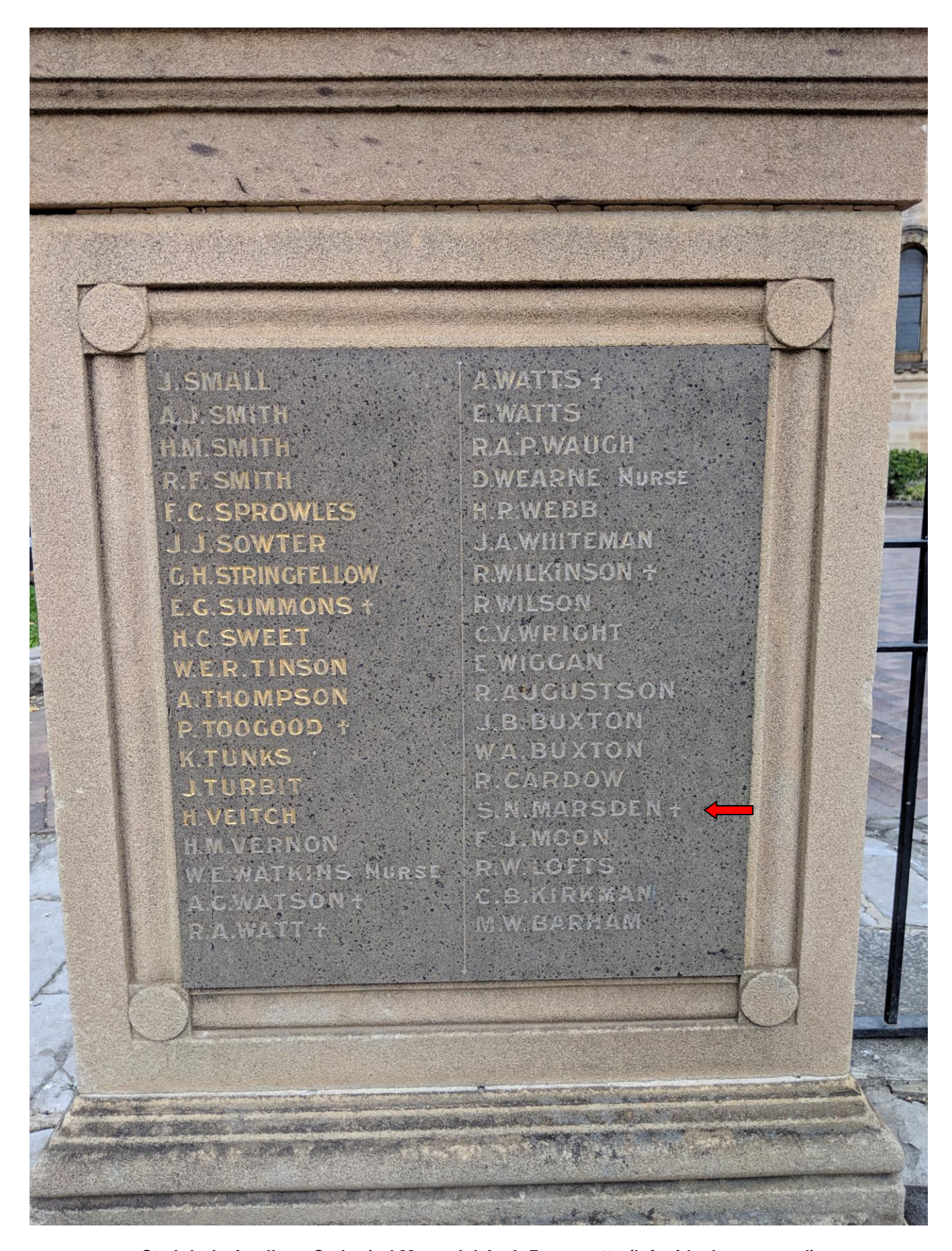
St. John's Anglican Cathedral Memorial Arch Parramatta (left side, lower panel)