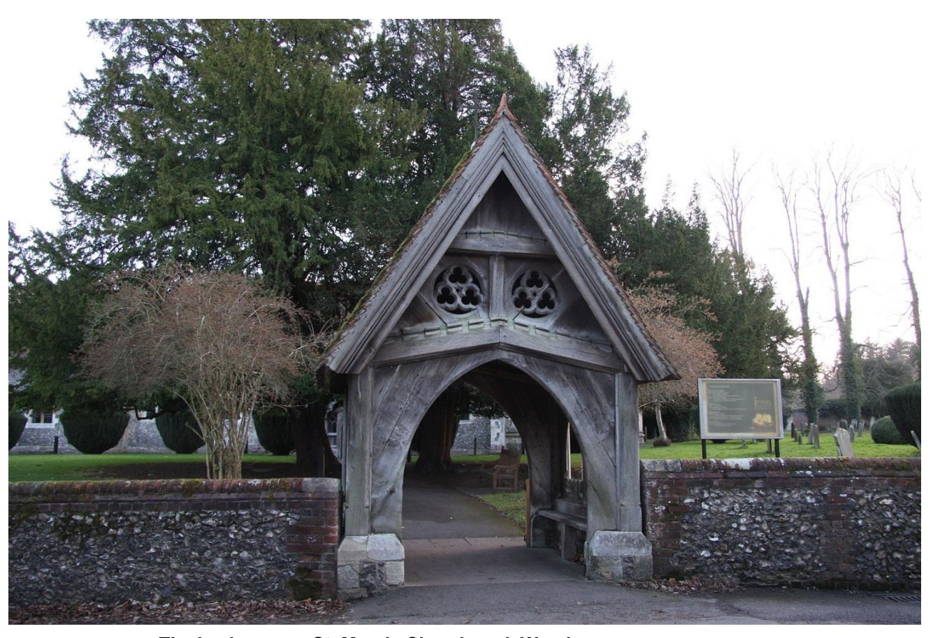
The Lych-gate at St. Mary's Churchyard, Wendover