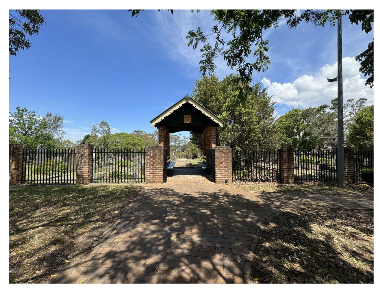
(Find a Grave – Frangipani)