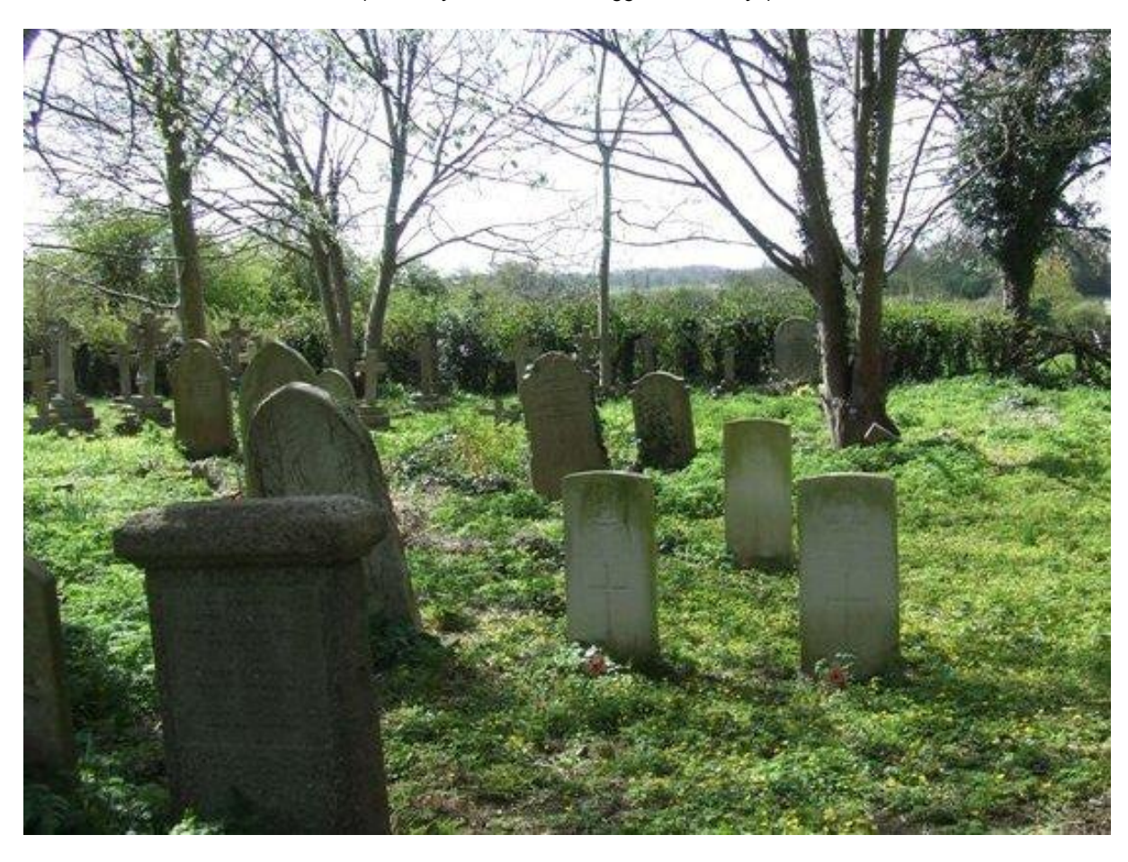
St. Mary & St. Hugh Churchyard, Harlow