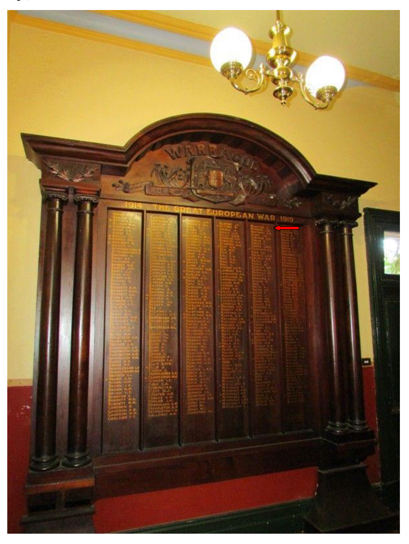
Warragul Honour Roll