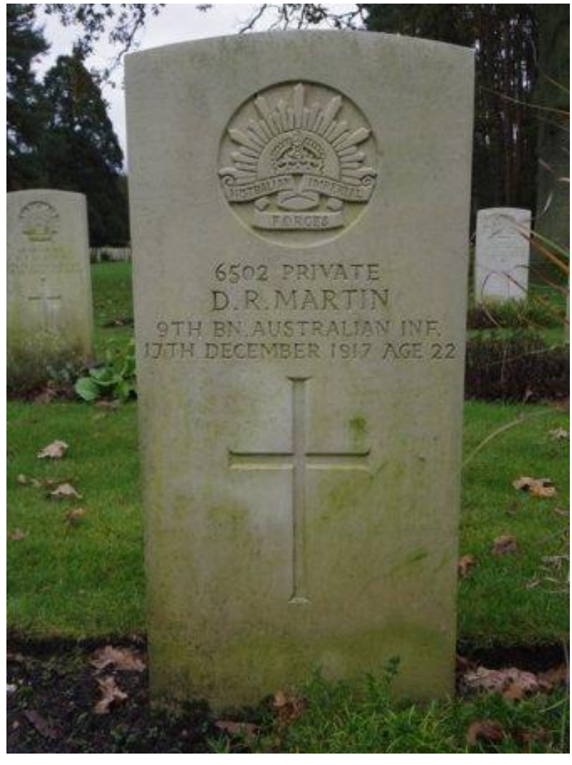
Earlier headstone without "MM."