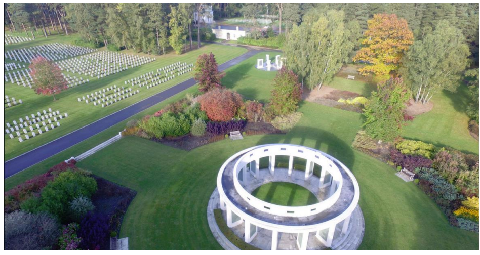
Brookwood Military Cemetery

There are 446 Australian War Graves in Brookwood Military Cemetery – 351 from World War 1 & 95 from World War 2.