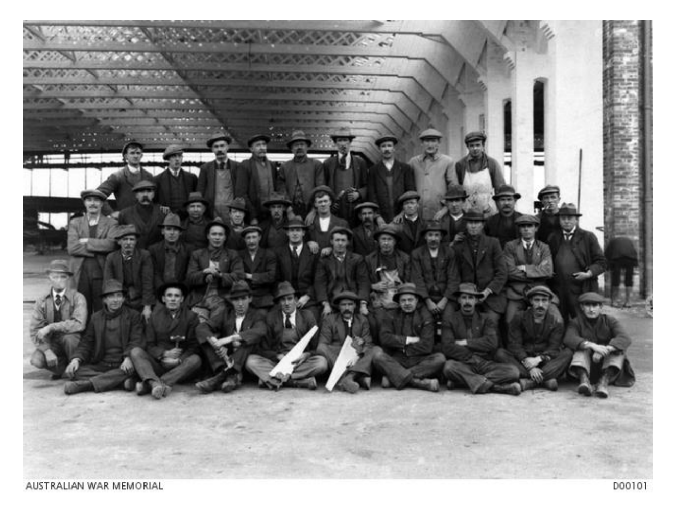
Group portrait of unidentified Australian munition workers in the general service shed at the Andover aerodrome. Some of the men are holding their tools. 1918