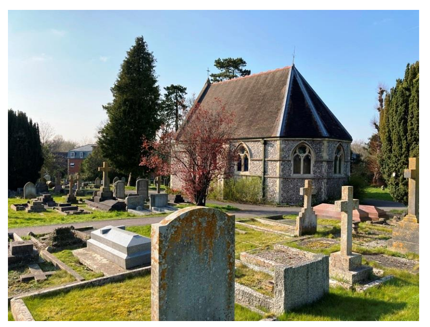
Andover Cemetery

Andover Cemetery contains around 90 War Graves, 37 of them from World War 1.