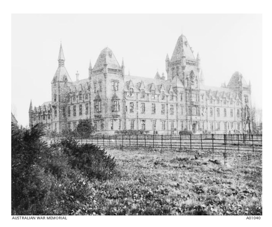
3rd London General Hospital, Wandsworth