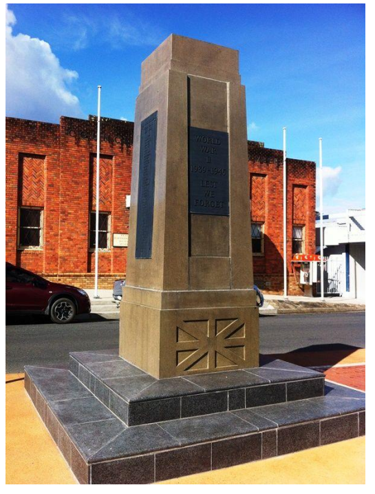
Bowraville War Memorial