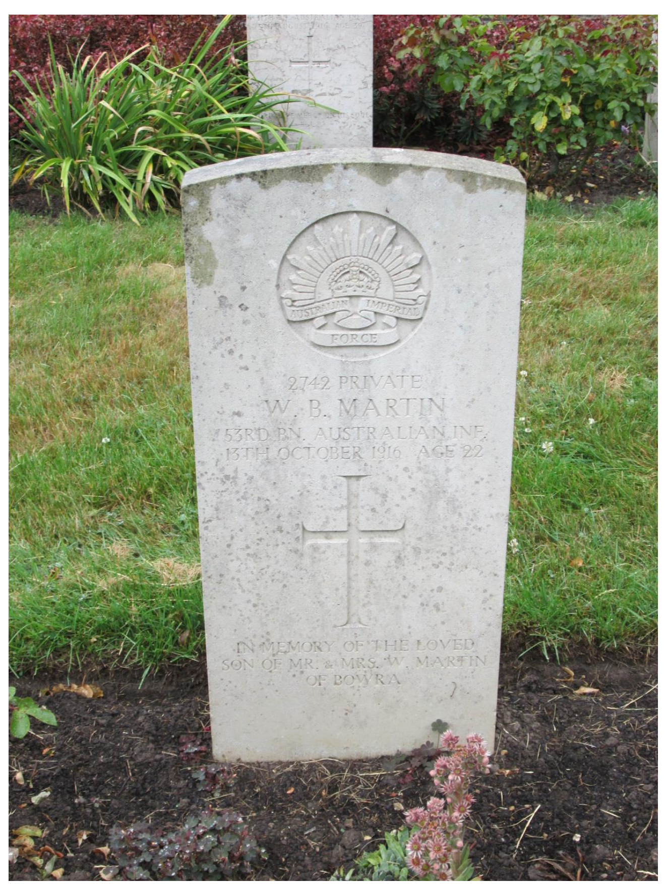
Photo of Private W. B. Martin's Commonwealth War Graves Commission Headstone in Wandsworth (Earlsfield) Cemetery, London, England.