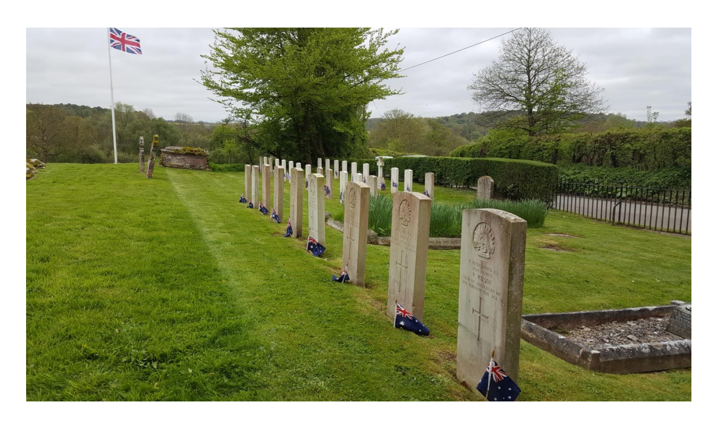
St. Edith's Churchyard, Baverstock