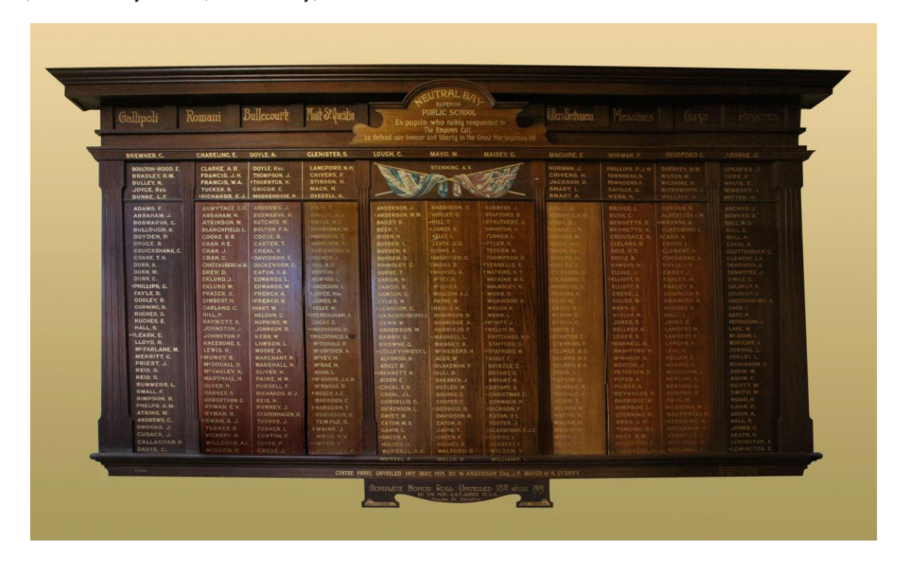
Neutral Bay Superior Public School Honour Roll