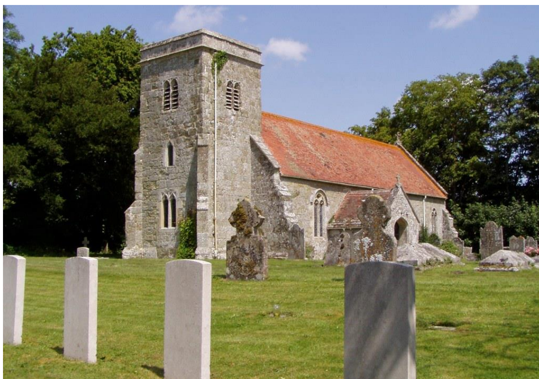
St. Edith's Churchyard, Baverstock, Wiltshire.

Sometime, Some Day Our Eyes Shall See The Face We Hold In Memory