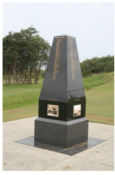
Catherine Hill Bay War Memorial