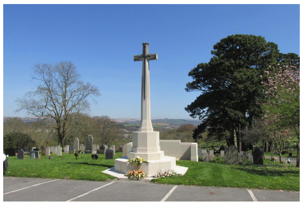
Cross of Sacrifice in Efford Cemetery, Plymouth