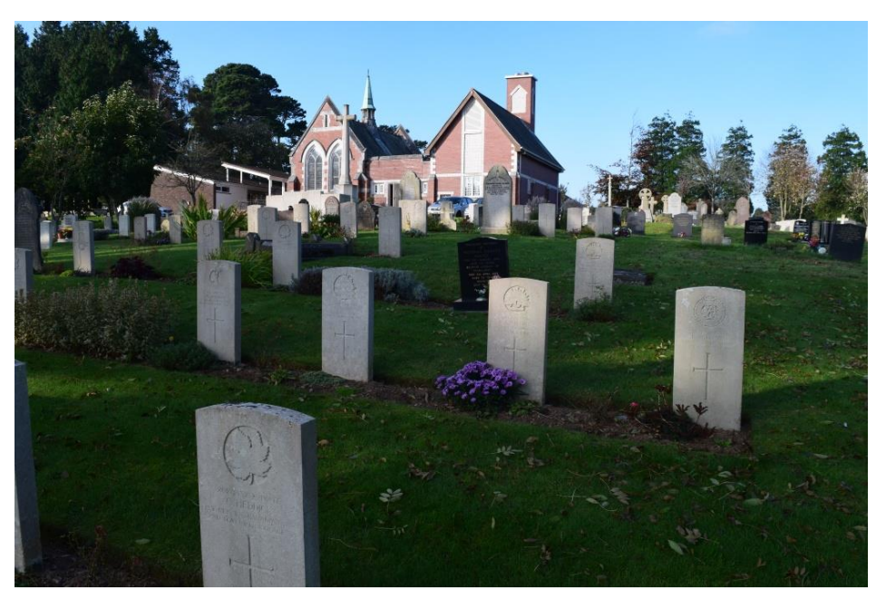
War Graves in Efford Cemetery, Plymouth