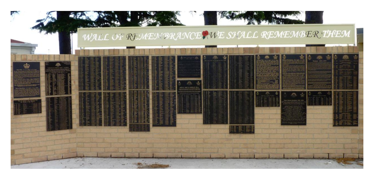
Wall of Remembrance, St. Helens, Tasmania

"What these men did nothing can alter now. The good and the bad, the greatness and the smallness of their story will stand. Whatever of glory it contains nothing now can lessen. It rises, as it will always rise, above the mists of ages, a monument to great hearted men; and for their nation, a possession forever."