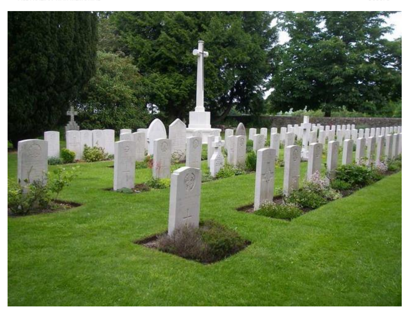
War Graves at Sutton Veny