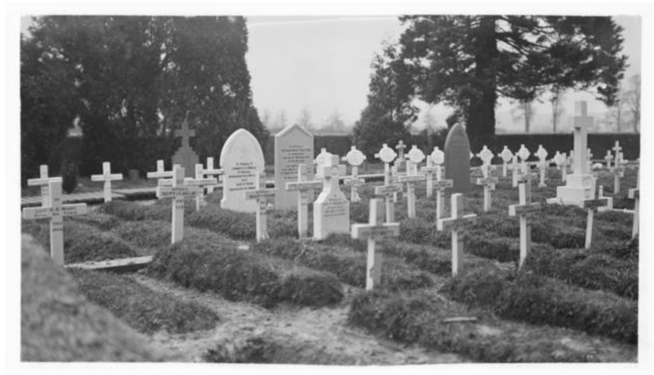
AUSTRALIAN WAR MEMORIAL D00376