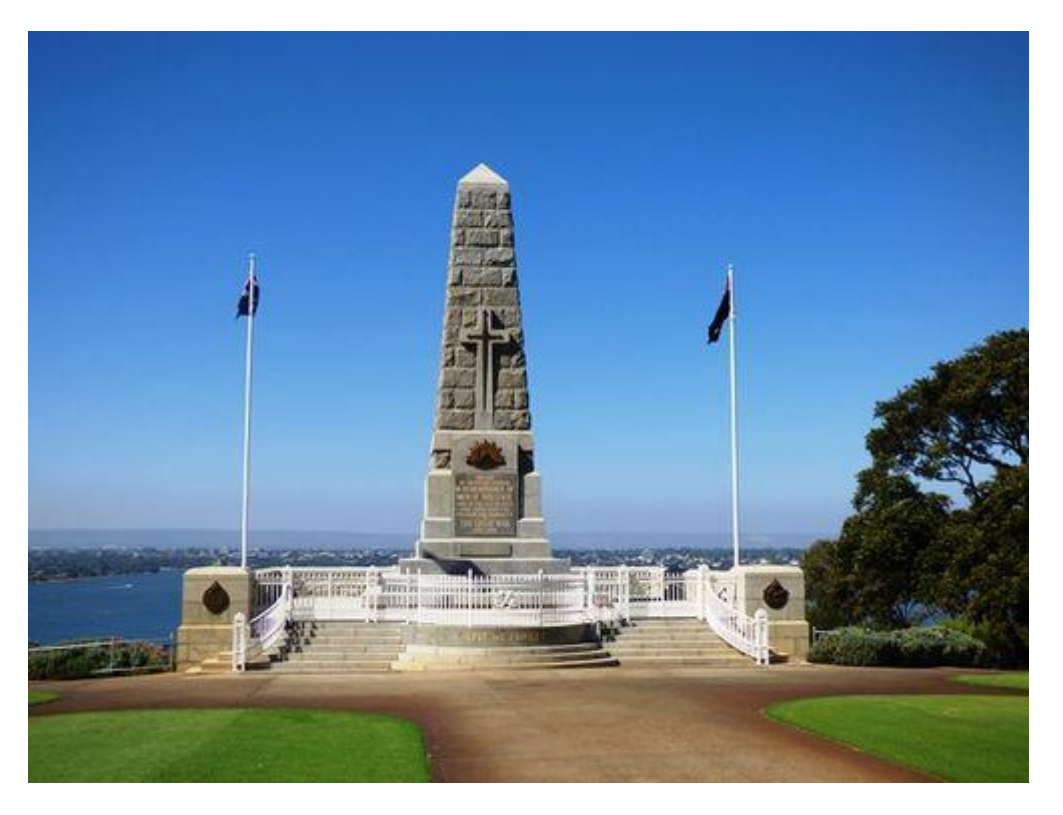
Western Australia State War Memorial Cenotaph, Kings Park (above) & (below) The Crypt with the Roll of Honour names

The heavy concrete foundations are supplemented by heavy brick walls which enclose an inner chamber or crypt. The walls surrounding the crypt are covered with The Roll of Honour; marble tablets which list under their units the names of more than 7,000 members of the services killed in action or as a result of World War One.