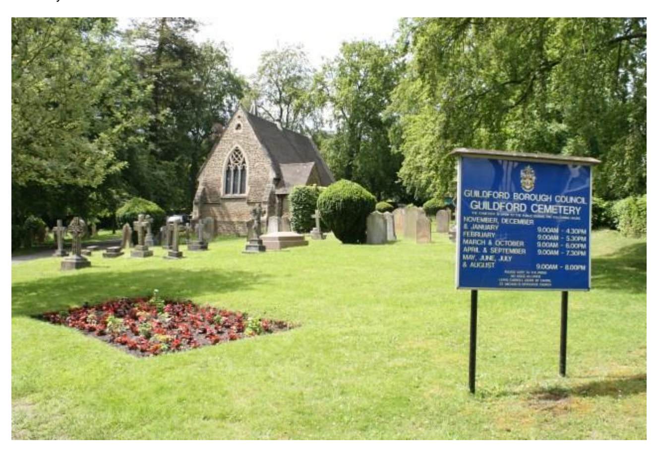
Guildford Cemetery

Guildford Cemetery is on the old Farnham Road. The Guildford War Hospital with 445 beds was established in the Infirmary. There are 33 Commonwealth War Graves in this Cemetery – 13 from World War 1 & 20 from World War 2. There is only 1 Australian War Grave.