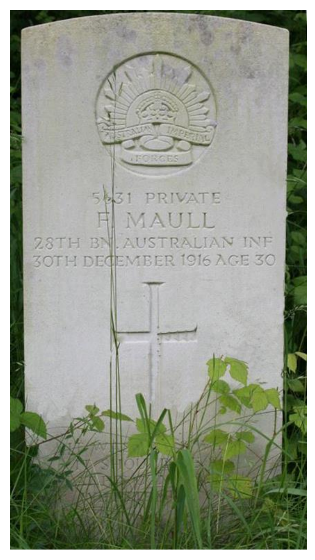
Photo of Private F. Maull's Commonwealth War Graves Commission Headstone in Guildford Cemetery, Guildford, Surrey, England.