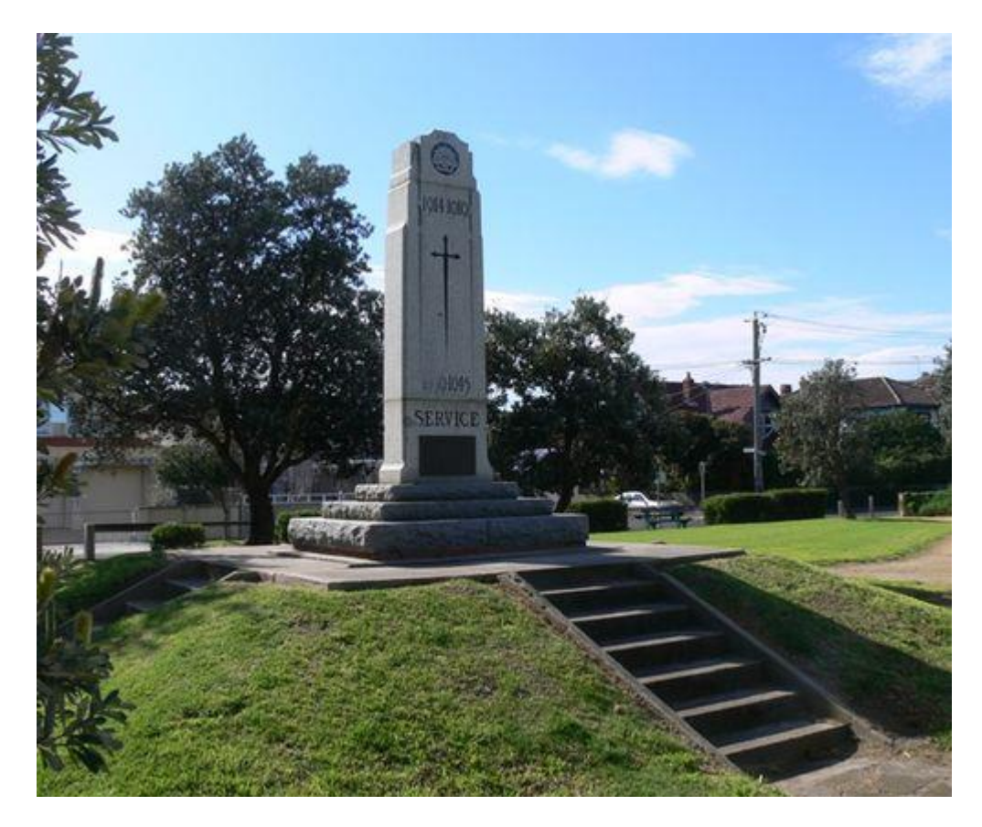
Sandringham Cenotaph

The Sandringham Cenotaph, located at The Crescent, Beach Road, Sandringham, Victoria does not list individual names.