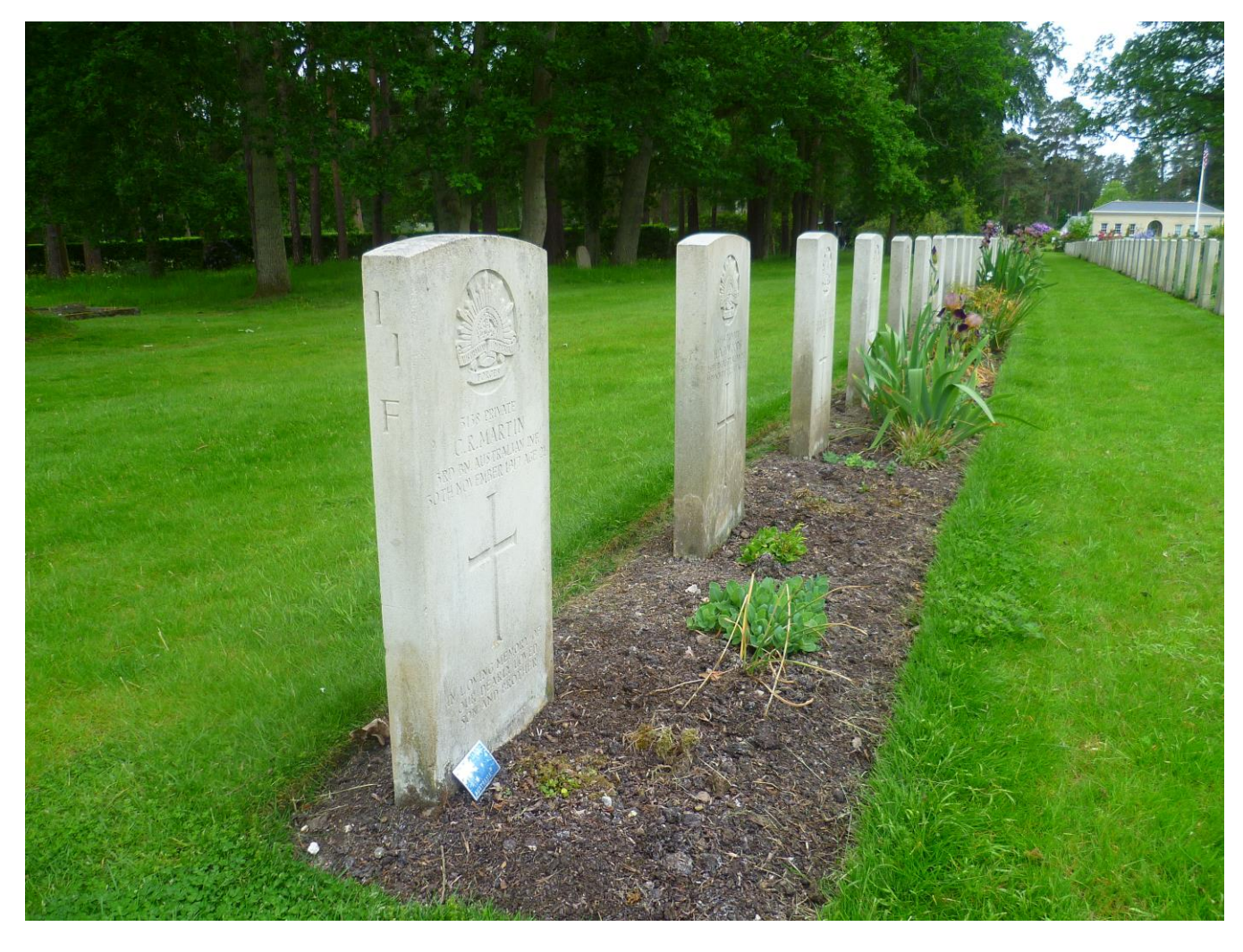
Plot 11 Row F – Brookwood Military Cemetery