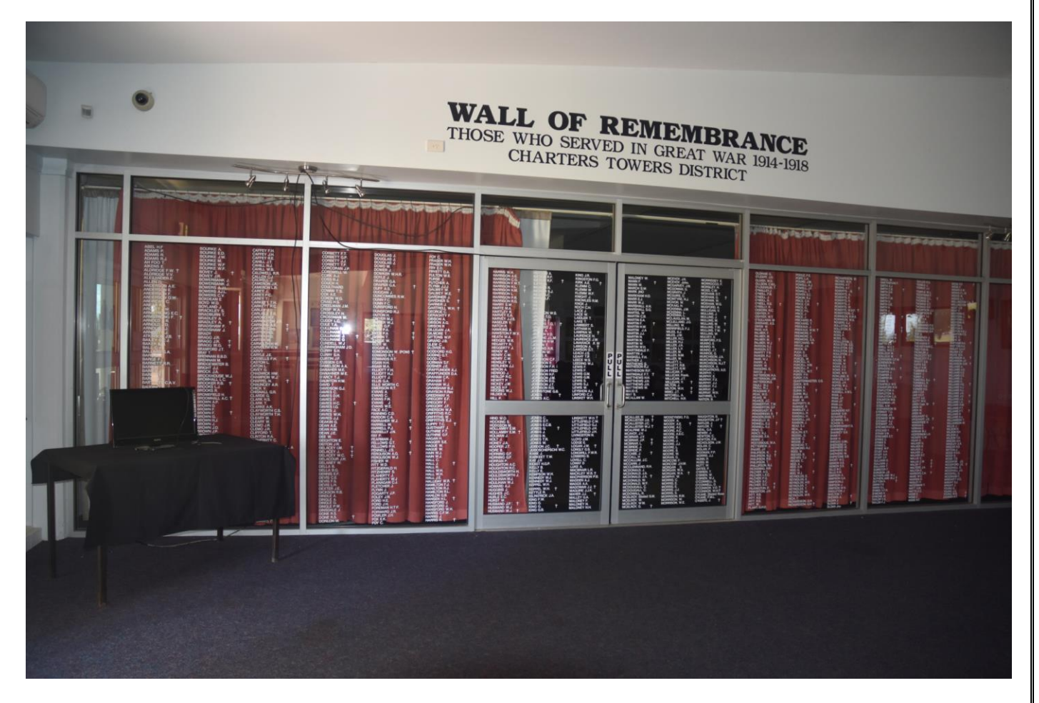
Charters Towers Wall of Remembrance