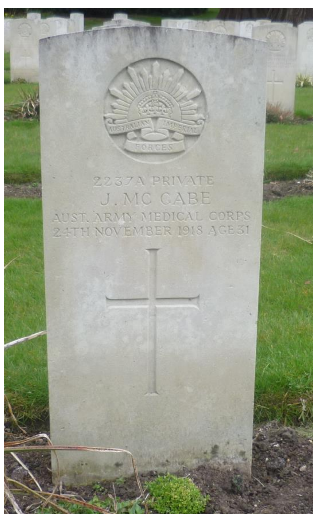
Photo of Private J. McCabe's Commonwealth War Graves Commission Headstone in Brookwood Military Cemetery, Surrey, England.