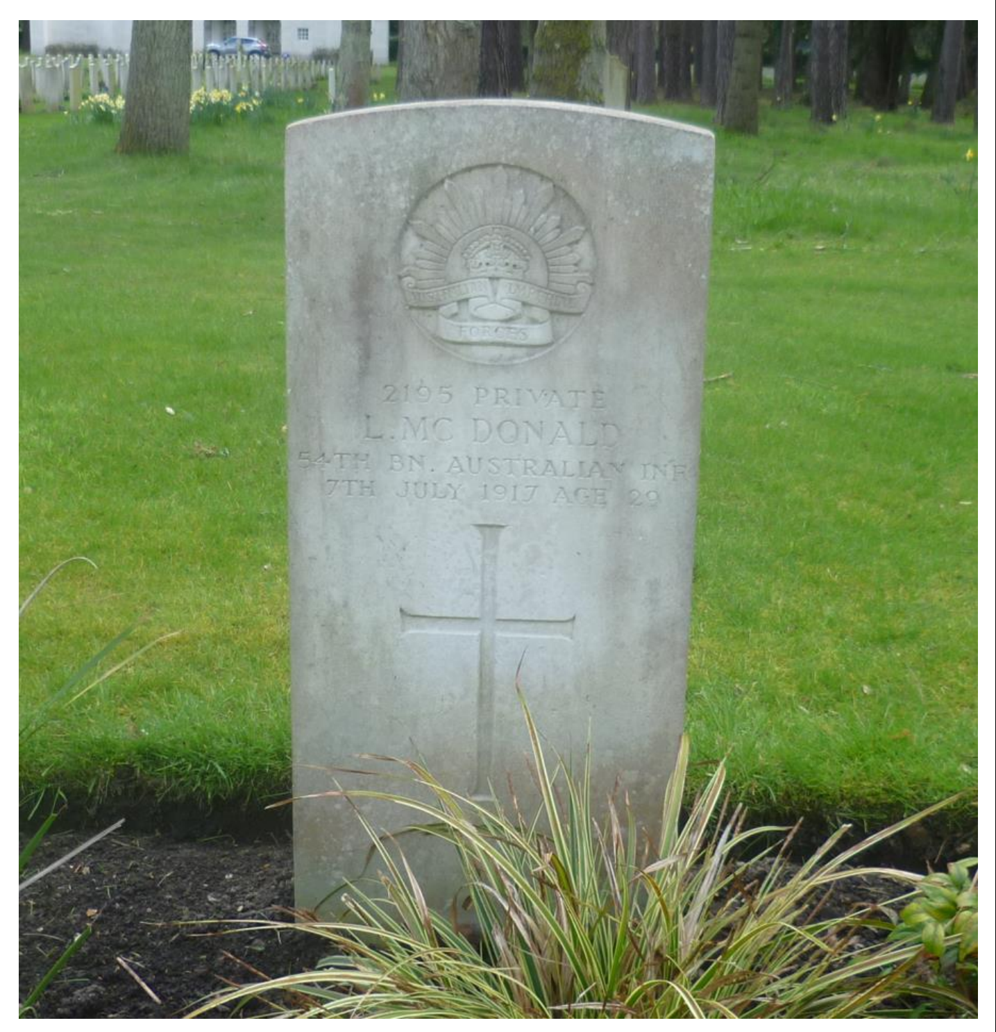
Photo of Private L. McDonald's Commonwealth War Graves Commission Headstone in Brookwood Military Cemetery, Surrey, England.