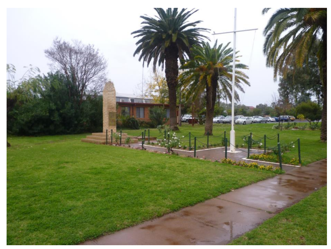
Cobar War Memorial

The Cobar War Memorial, located at Drummond Park, Linsley Street, Cobar, NSW does no list individual names.