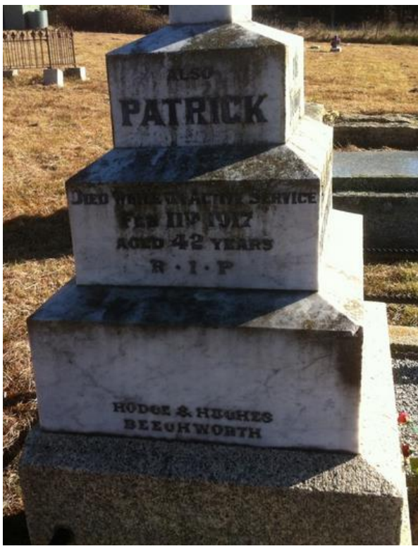
McElhenney Headstone located in Stanley Cemetery, Victoria