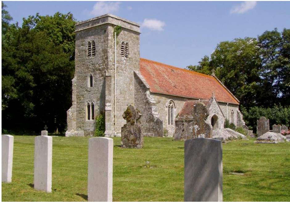
St. Edith's Churchyard, Baverstock, Wiltshire.