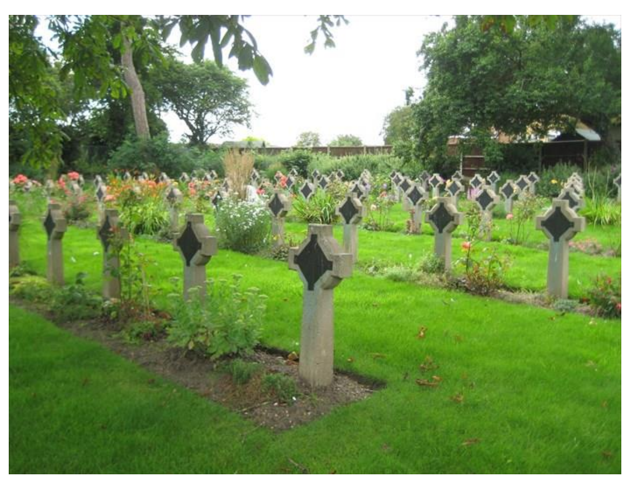
Caister Old Cemetery, Great Yarmouth, Norfolk, England