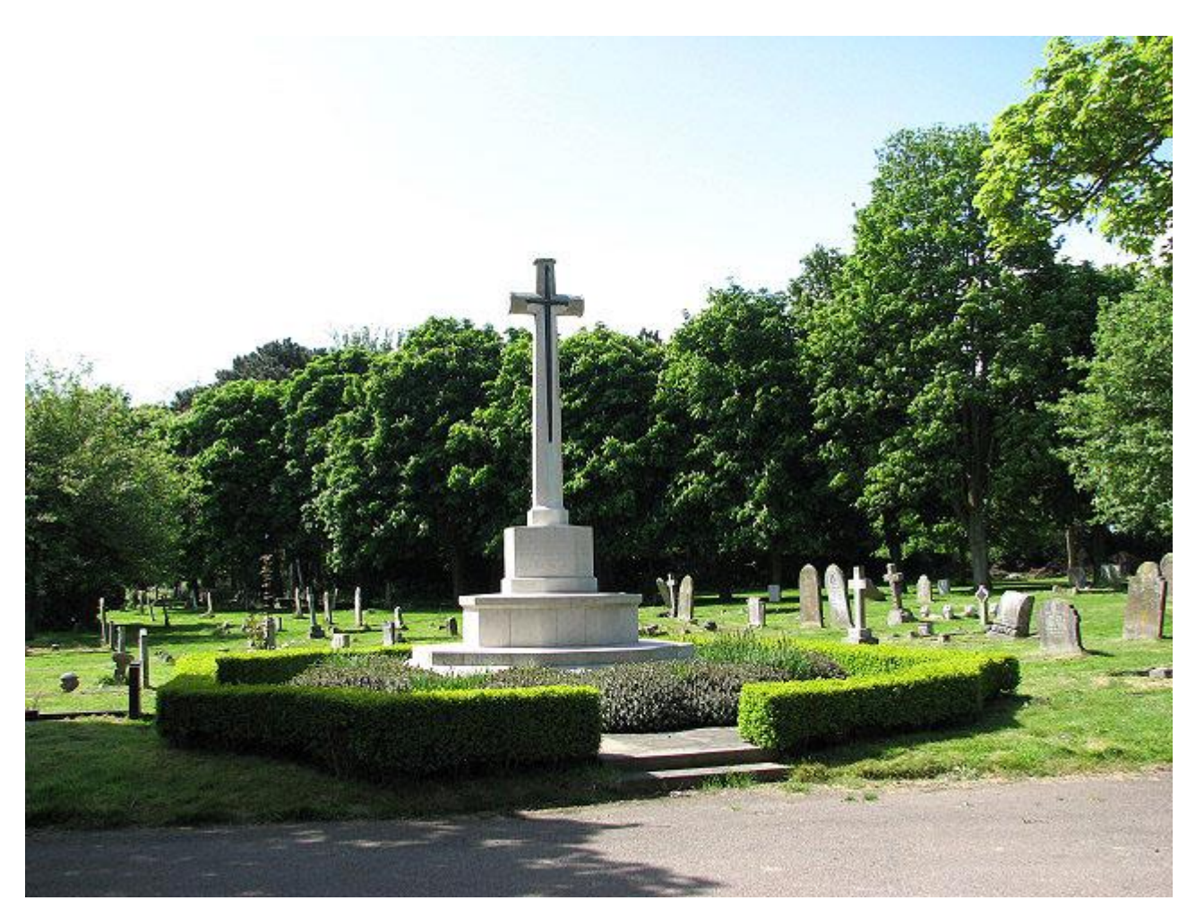
Cross of Sacrifice in Caister Old Cemetery