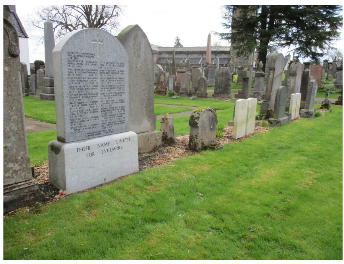
Mar's Wark Cemetery, Stirling