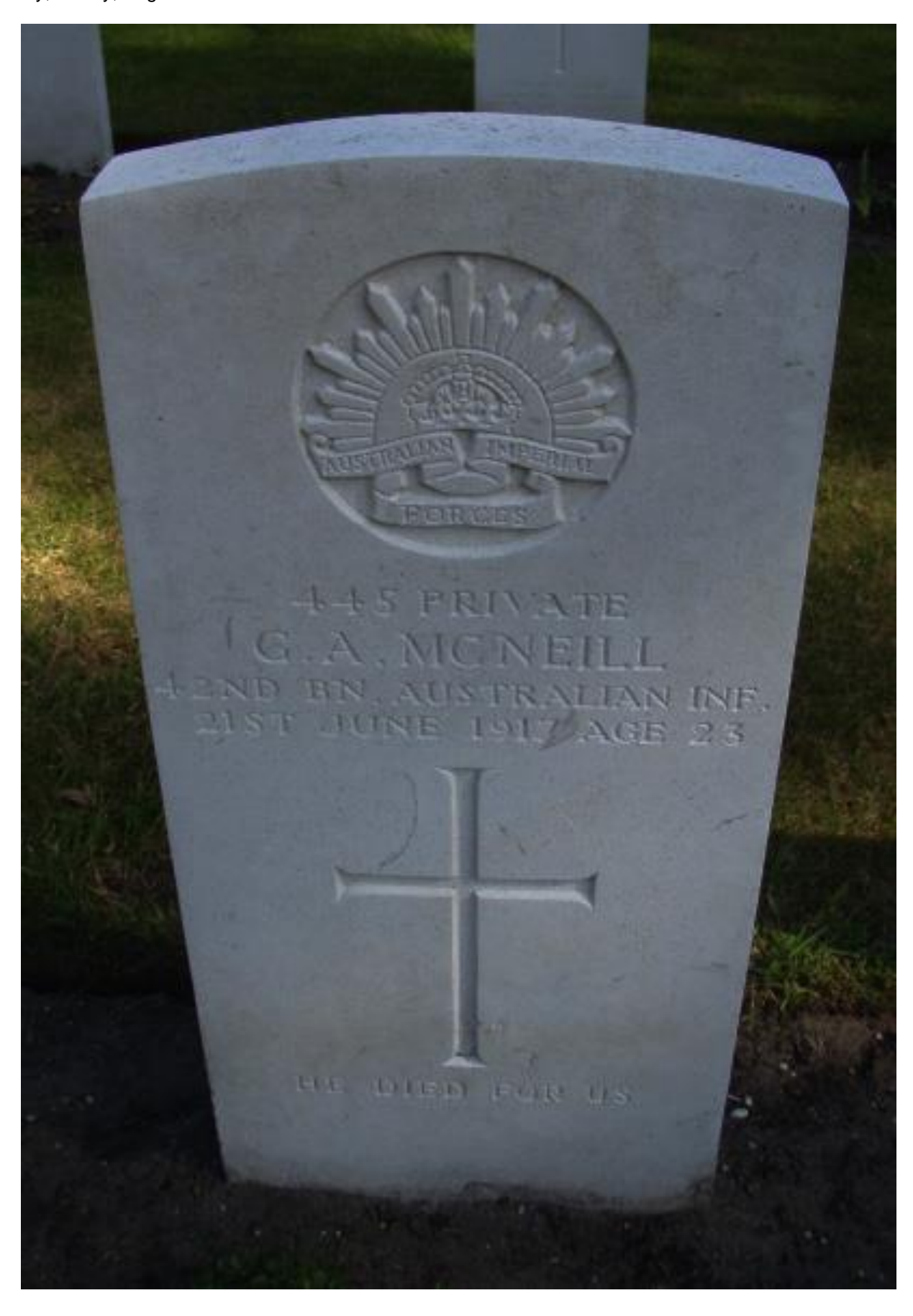
Photo of Private G. A. McNeill's Commonwealth War Graves Commission Headstone in Brookwood Military Cemetery, Surrey, England.